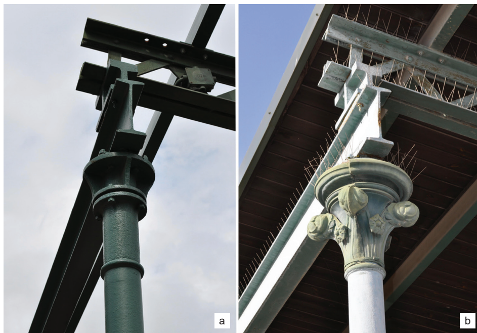
Il. 8. Malbork, dworzec PKP, detal głowicy żeliwnego słupa wiaty peronowej przed zamontowaniem dekoracyjnych nakładek i po zamontowaniu: a) stan z 2014 r., b) stan z 2020 r.

decorative capitals bonnet (Fig. 8). They replaced the originals, which presumably were present here and were deteriorated over the decades 18 . The contemporary form of the overlays applied is a relatively liberal reference to those used in 19 th -century capital realizations, and its contemporary origin is recognizable without difficulty. Nevertheless, the material and quality of workmanship are not of the highest standard. They were made of plastic or thin sheet of non-ferrous metal 19 . These materials have aged differently from the painted surfaces of the metal pillar (Fig. 8). While the fastening systems of the cast-iron capital elements remain in most cases invisible, the described bonnets in Malbork were attached to the column using steel clamps. Undoubtedly, such a method of assembly is exposed to easier destruction and may also have a negative impact on the aesthetics of the solution. Commendable in this realization is the decision to restore the pillars' incomplete form and the use of patterns indicating their non-authentic origin. To some extent, the selection of material applied may be justified by the nowadays difficulty of replicating a historic building fabric – in preference to a readily available plastic. Nevertheless, as the examples illustrate: