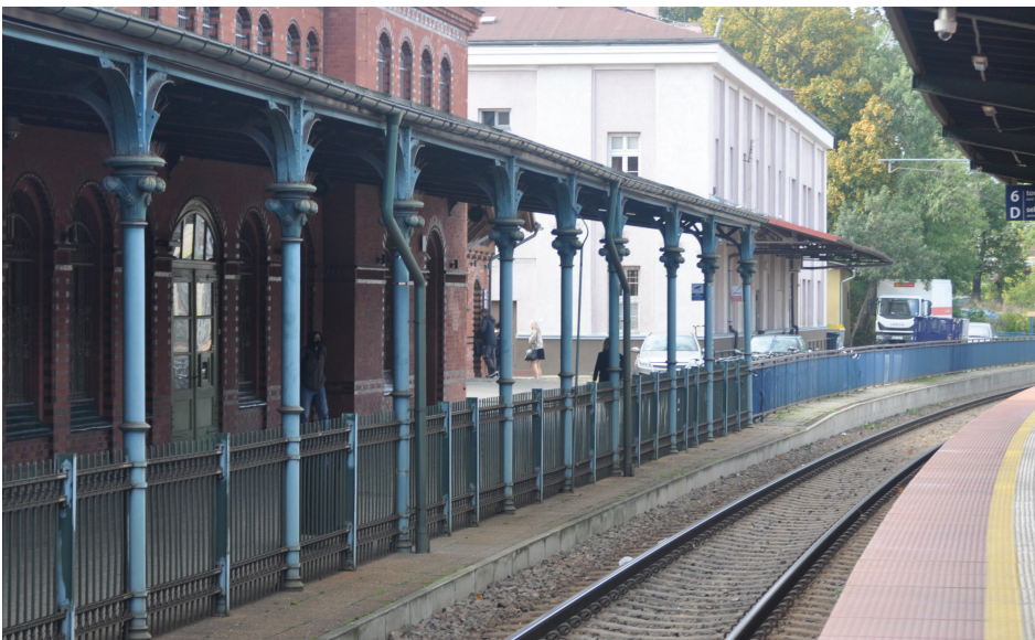
Fig. 7. Malbork railway station, single-pitched platform shelter with cast-iron pillars, the state in 2020

Il. 6. Sopot, dworzec PKP, widok ogólny i detal konstrukcji wiaty peronowej na peronie dalekobieżnym zrealizowany około 2011 r., stan z 2020 r.