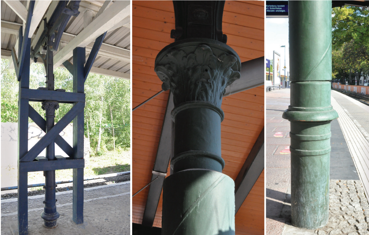
Fig. 9. Berlin, examples of repair work on cast-iron columns of platform shelters in S-Bahn stations, the state in 2019

Il. 9. Berlin, przykłady prac naprawczych żeliwnych słupów wiat peronowych na stacjach S-Bahn, stan z 2019 r.