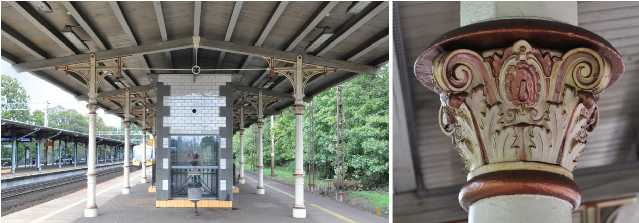
Fig. 5. Sopot railway station, general view and construction detail of the 19 th -century cast-iron platform shelter on the platform of the SKM (Rapid Urban Railway), 2020

Il. 5. Sopot, dworzec PKP, widok ogólny i detal konstrukcji XIX-wiecznej żeliwnej wiaty peronowej na peronie Szybkiej Kolei Miejskiej, stan z 2020 r.