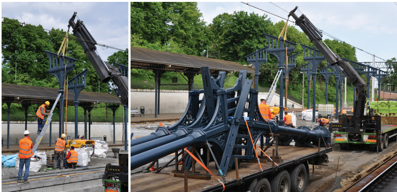
Fig. 3. Gdańsk Główny railway station, works of reassembly of the renovated cast-iron pillars of platform No. 2, 2018 Il. 3. Gdańsk Główny, dworzec PKP, prace przy ponownym montażu odnowionych żeliwnych słupów zadaszania peronu 2, stan z 2018 r.