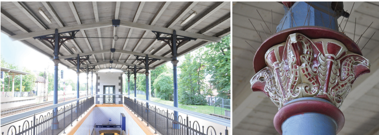
Fig. 6. Sopot railway station, general view and construction detail of the platform shelter on the long-distance platform created about 2011, the state in 2020

Il. 5. Sopot, dworzec PKP, widok ogólny i detal konstrukcji XIX-wiecznej żeliwnej wiaty peronowej na peronie Szybkiej Kolei Miejskiej, stan z 2020 r.