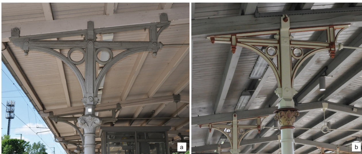
Fig. 4. Comparison of the upper parts of cast-iron columns supporting platform shelters: a) Berlin S Wannsee Bahnhof, 2019, b) Sopot, 2020