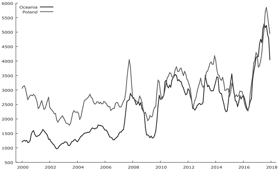
Fig. 3. Prices of butter in Poland and Oceania in 2000-2017 (€/tons)

Source: own work based on (CLAL.IT, n.d.).