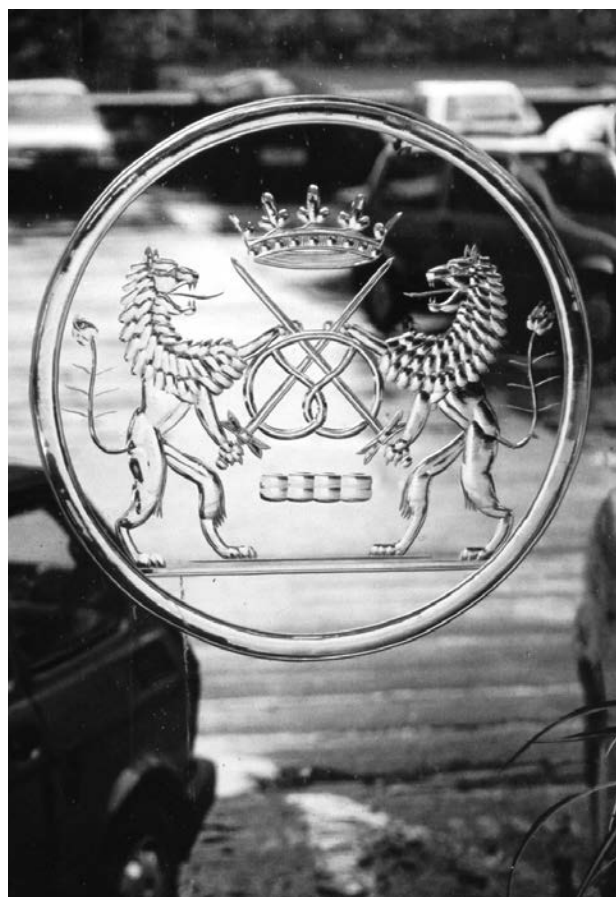
Fig. 10. Staircase window pane

Nowadays, the Town Hall in Szczytno does not arouse any negative emotions and it is no longer associated with the period of the Third Reich. There is a legend connected with the Teutonic Order castle; however, not with its real and actual functioning but with the role ascribed to it by Henryk Sienkiewicz in his famous novel Krzyżacy ( Teutonic Knights ). It was in this castle that a famous Polish knight Jurand from Szychów fought bravely with the Teutonic knights and also here his daughter Danusia was kept as a prisoner. These novel characters were animated in 1960 by Aleksander Ford in his film entitled Krzyżacy which was the first wide-screen movie in Poland to be watched by as many as 30 million people. The whole subject was mythologized mainly due to the talents of Sienkiewicz and Ford; the novel is still an obligatory school book and the film is watched by young people until today. The legend of the Middle Ages combined with historical facts and the remains of the castle architecture is much stronger – and also more attractive – than the history of the Third Reich, especially from