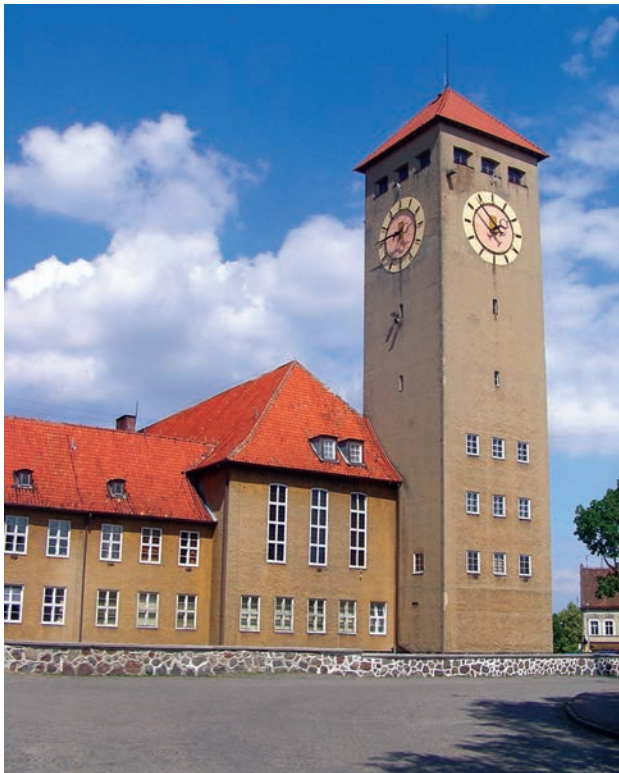
Fig. 2. Town Hall in Szczytno, view from the south Il. 2. Ratusz w Szczytnie, widok od południa

ticular wings have various body heights and sizes following examples of medieval structures and they are covered by two- or four-pitch roofs. The whole building is surrounded by a dry moat. The courtyard is approached through the northern wing.