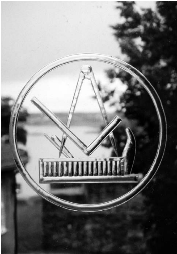
Fig. 11. Staircase window pane