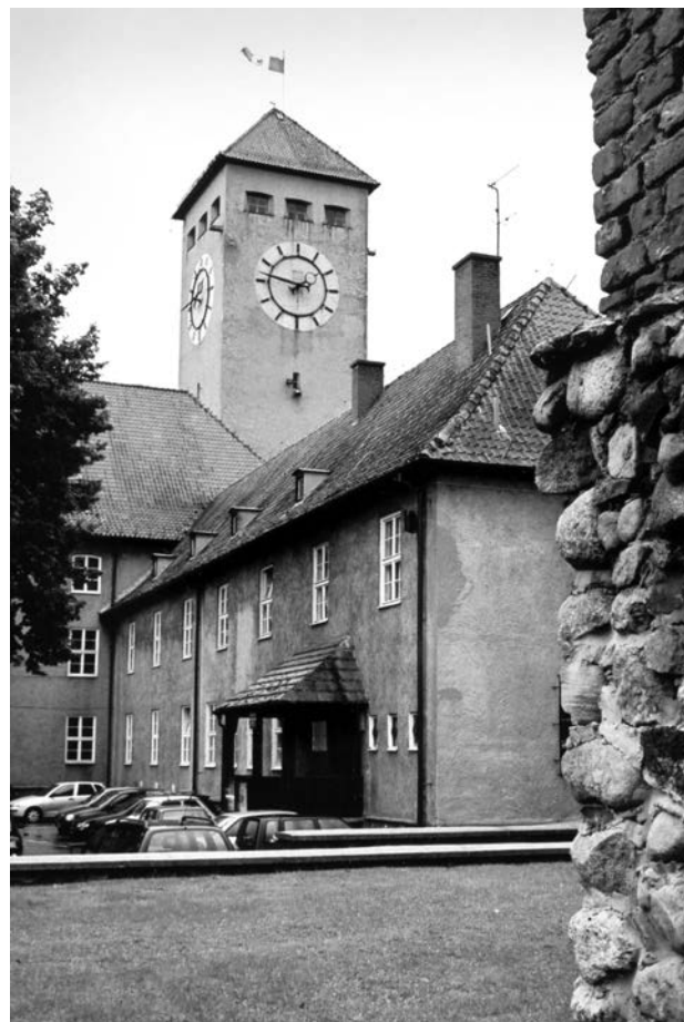
Fig. 6. Wooden bay window in the southern elevation of the southern wing

Il. 6. Drewniany wykusz ratusza w południowej elewacji południowego skrzydła