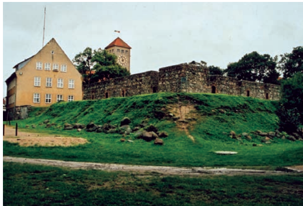
Fig. 3. Ruins of the castle, view from the lake (photo: J. Dobesz) Il. 3. Ruiny zamku, widok od strony jeziora (fot. J. Dobesz)