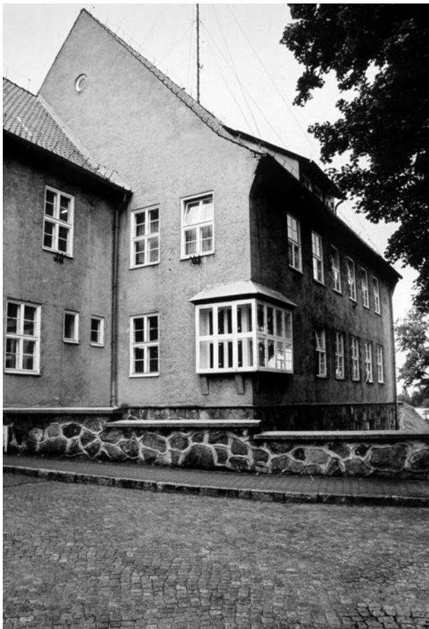
Fig. 7. Corner bay window in the northern wing

Il. 7. Narożny wykusz-okno w skrzydle północnym