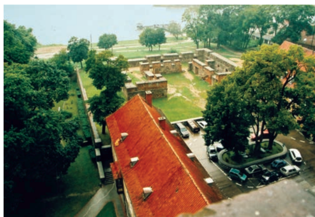
Fig. 4. View from the town hall tower on the ruins of the Teutonic Order Castel and the lake Il. 4. Widok z wieży ratusza na ruiny zamku krzyżackiego i jezioro

Prussia’ 4 . Thus, the town hall was erected on the ruins of the Teutonic Order castle which, especially from the perspective of today, was a specific kind of barbaric intervention and destruction of the historical structure of the original construction. At the same time this place was historically the town centre. Situated on a peninsula between two lakes, it was the beginning of the east-west axis along which the town developed starting from a market settlement of a street-like character which was located between the castle and a trade route. At first, the settlement was the main street of the town, i.e. the former market place and next to it was Market Street (Marktstrasse) – now the name of the street is Odrodzenia Street.