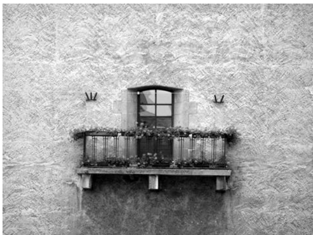
Fig. 5. Balcony of the town hall tower

Il. 5. Balkon wieży ratuszowej