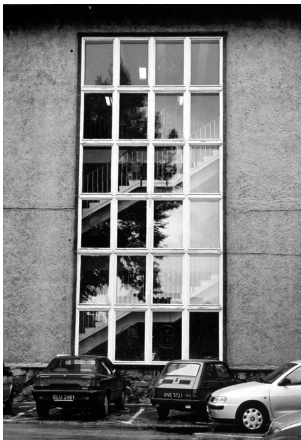
Fig. 9. Staircase glasswork