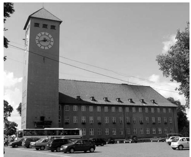
Fig. 1. Town Hall in Szczytno, view from the east

which was the seat of the district order administrator. The castle was situated by the lake Jezioro Duże Domowe and even today we can see its ruins which form a square opened to the town hall courtyard. The Town Hall itself consists of three wings surrounding a yard with a tall (46 metres high) tower built asymmetrically in the south-east corner. The tower is located in front of the elevations of the adjacent wings which emphasizes its massive character. In the south in the lower part it has three rows of small windows above which there are only narrow shooting windows providing some more light to the staircase. On the top floor there is a clock with four dials one on each elevation, inside there are two bells from the year 1937 which are driven by an electric mechanism striking every quarter of an hour as well as every hour. The tower is covered by a four-pitch roof. In the lower part of the tower's eastern elevation on the same level as the second storey of wings there is a large balcony belonging to a room that was supposed to be the mayor's office. The par-