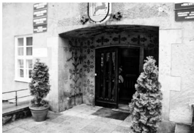
Fig. 8. Main entrance to the town hall

The staircase, which leads to the two higher floors, was provided with more light by means of a huge window, circa 4.5 m wide extending from the pedestal up to the cornice of the elevation. The window consists of 24 rectangular parts with wooden frames; each window has a pane with dimensions of 1.8 × 1.1 m. Twelve panes are ornamented with heraldic representations and symbols of various crafts and trades forming a circle 70 cm in diam-