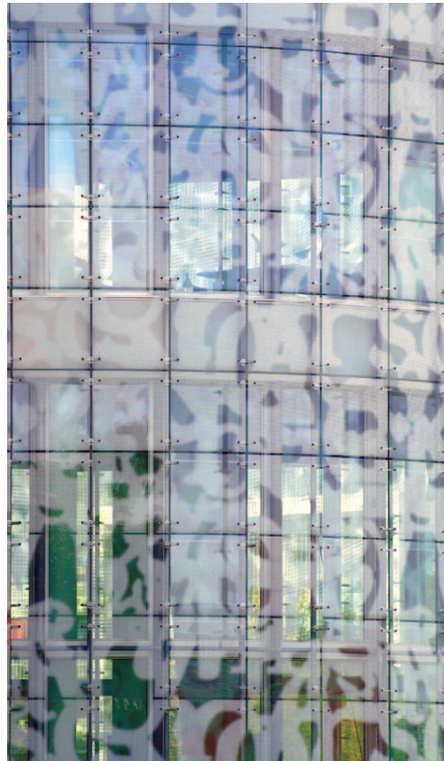
Fig. 6. IKMZ – Technical Library of Cottbus, Brandenburg Technical University, arch. Herzog & de Meuron, 2004

According to Herbert Muschamp: [...] what links [...] projects, apart from their transparent and translucent skins, is that the building’s skin is used not to reveal but to veil [10, p. 43]. Glazing no longer performs a classic function of the modernistic curtain wall. New semi-opaque and translucent façades deceive the eye, and produce a magical effect of a curtain. Application of many layers of translucent and semi-opaque materials leads to the formation of zones with different light transmission characteristics. These zones are not “flat”, but gain spatial depth contained between the layers of glass. A unique optical buffer is created, which is analogous to thermal and acoustic ones.