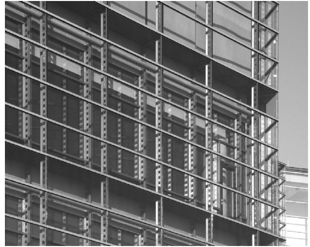
Fig. 4. CCN Ost Congress Centre, arch. S + P Heinz Seipel Ges. von Architekten mbH, 2006

A distinctive example of superimposition of fragmented virtual images is the German parliament office building Jakob-Kaiser Haus. Two segments of the south facing façade of block no. 5 and 6 were designed and constructed as a double layer façade: additional sheet of transparent glazing was placed in the front of standard office building wall with glazed windows. Due to the limited precision of the façade's execution, individual sheets of glass are not exactly in the same plane, so each pane reflects a different section of the building located at the opposite side of the street. Smallest shifts are easy detectible by the observer's eye because the juxtaposed building was equipped with rhythmic and orthogonal decoration. Regularly distributed windows and sun shades are fragmented and moved, almost "trembling". Two layers of glass make the phe-