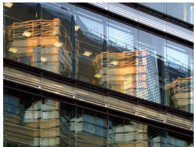
Fig. 2. Department store of the Galleries Lafayette in Berlin, arch. Jean Nouvel, 1995

Various configurations of transparent panes of glass lead to different formal and architectural appearances. Sometimes the effect of the imposition is almost picturesque, in other cases, even disturbing. Glass panes of the façade are never mounted exactly in one plane, so the reflections in individual sheets of glass are slightly shifted. This fragmentation of virtual image reminds of the cubist style, which is breaking the continuity of the presentation by the fragmentation of objects and visual integration of image is destroyed [8]. The designer is unable