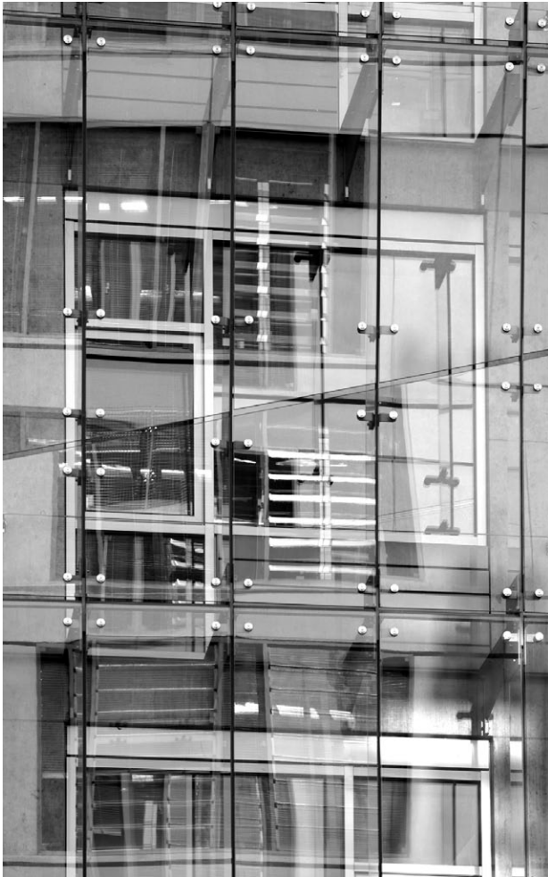
Fig. 3. Jakob-Kaiser-Haus in Berlin, arch. de Architekten Cie, Pi de Bruijn, 2002

Il. 3. Jakob-Kaiser-Haus w Berlinie, proj. de Architekten Cie, Pi de Bruijn, 2002