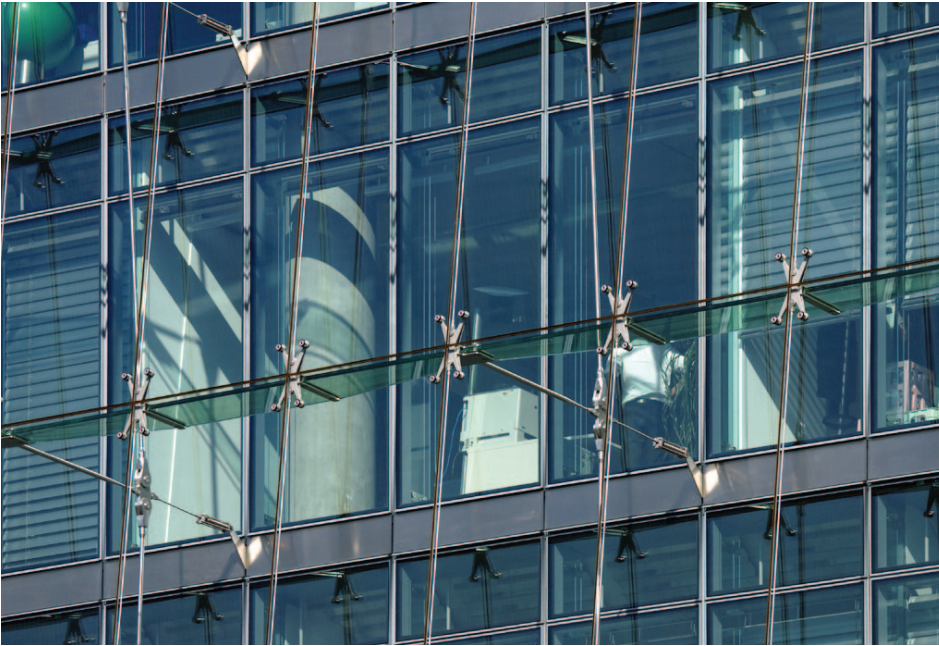
Fig. 5. Sony Center, arch. Murphy & Jahn Architects, 2000

Il. 5. Sony Center, proj. Murphy & Jahn Architects, 2000 (foto. M. Brzezicki)