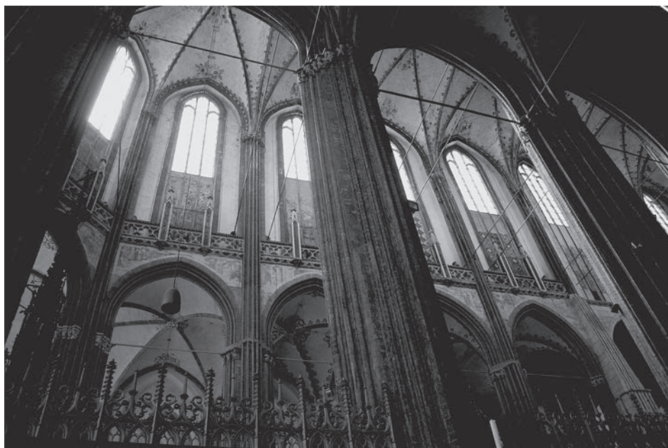
Fig. 5. Blessed Virgin Mary Church in Lübeck – view of the choir from the northern side.

by ambit and ring. The particular character of the Blessed Virgin Mary Church consists in fixing the ring in three sides beyond the chapels by-pass space – along with the corresponding ambit bays they have cross-ribbed vaults. In this way a sort of standardisation and spatial uniformity were achieved, while a free flow of space differed from a separated series of chapels of French Gothic cathedrals or the Köln cathedral [1] 15 .