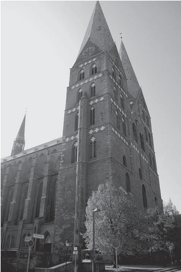
Fig. 1. Blessed Virgin Mary Church in Lübeck – view from north–west.

up a merchant centre near the old settlement of Obotrites called Old Lübeck 6 . The location in 1158 probably included a territory around a big, rectangular market square which was surrounded with stands and cloth halls in the north–east corner where the town hall was supposed to be built soon 7 . In 1160 the seat of the bishop was moved to Lübeck and construction works on two churches were started – a cathedral and Marienkirche. During the next years, Lübeck was granted numerous privileges confirmed by Frederick I Barbarossa and in 1226 Frederick II conferred on the town ‘ civitas Imperii ’ dignity 8 . This dignity was not conferred on any other town situated beyond the River Elbe, which increased Lübeck prestige and in connection with its growing material power predestined this town to become a leader of Hanseatic trade which started to develop at that time [4].