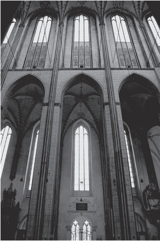
Fig. 6. Blessed Virgin Mary Church in Lübeck – nave body.

of lancet arches originates from the spirit of brick architecture 17 .