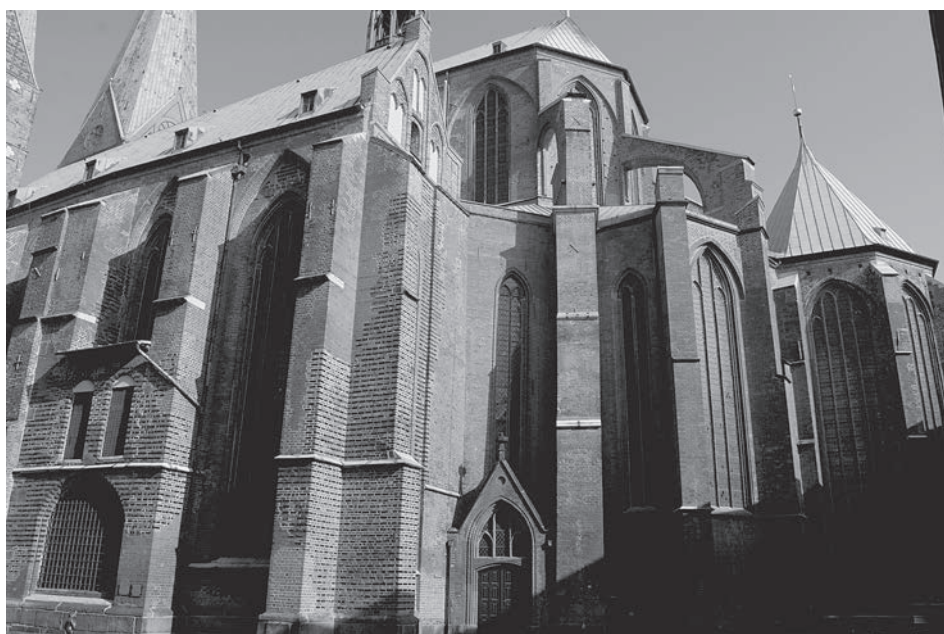
Fig. 3. Blessed Virgin Mary Church in Lübeck – view of the choir from south-east. Photo by author

changed the traditional basilica form space adapting it for the needs of the growing congregation [1] 10 .