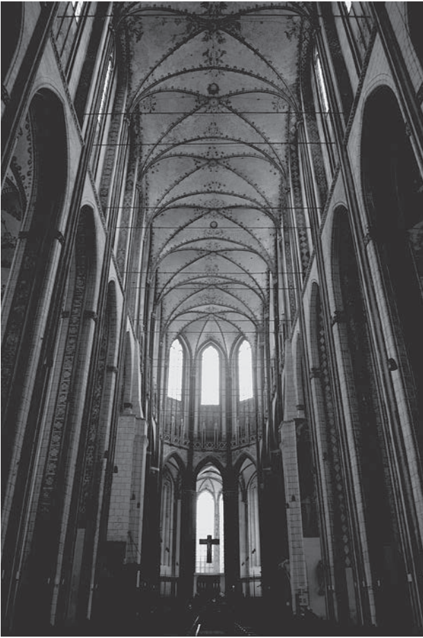
Fig. 4. Blessed Virgin Mary Church in Lübeck – view of the body and choir.

pillars forming in this way a graduated arrangement of the wall, which reduced the massive structure of the walls. The hall rebuilding also included the transept as well as the root of the choir gallery. In the place of the demolished southern transept front a porch was built whose construction was completed in 1270, which is confirmed by the date of consecrating the altar and the burial which took place there. Its eastern gable with a three-level form articulated with blind windows was preserved under the roof in the porch of the mayor chapel which was built later at the eastern side. The original porch probably had a crossed and ribbed vault, however, when a new bypass choir gallery with a basilica form was built, the re-organisation of its space and introduction of pillars into the interior, which divided it into two bays, took place. The name of the whole architectural trend – Viertelstab gotik – originates from the application of circular shaped stones in the window splayed embrasures and also in the area of the porch vaults. Their sizes, which were in accordance with the size of normal bricks, made it possible to achieve a homogenous course of the pattern in the pillar profiles and window frames which resulted in limiting the number of harmonised shaped stones in pillars. Moreover, their composition was a sign of mature – Gothic stylistic forms which stood in opposition to explicitly separated architectural elements of the Roman buildings.