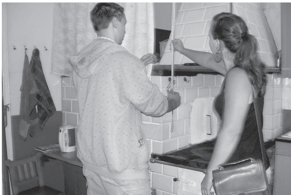
Fig. 6. Measurement of the kitchen stove, Czyże village.

measurements with the use of a tape measure and gave readings to be included in the drawings. The field sketches are an indispensable element of collecting data, and the participants were encouraged to make them. The explanations of the principles of the perspective, presentation of free-hand sketches (Fig. 1), drawing techniques, methods of application of different techniques and drawing instruments: pencil, pen and ink, charcoal proved helpful. The students were willing to present their own drawing skills and attentively listened to professional advice.