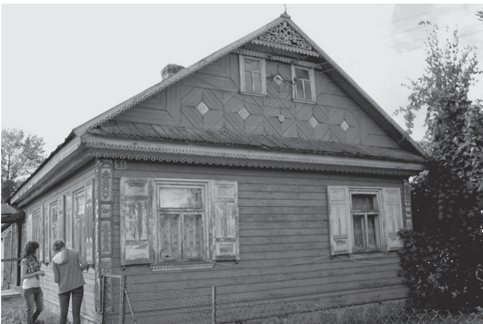
Fig. 5. Measurement of corner decorations of residential building, Czyże village.

While doing that they used the questionnaire prepared by the workshop organizer in which the most important issues were listed e.g. general data such as the name and address of the building, including their name in local dialect, date of construction, history of erection, builder and owner as well as a sketch of location of the building in the homestead, names of individual rooms, building and finishing materials, description of decorative details, information about tools and furniture. The data regarding renovations, modernizations altering the original shape were also important. Other persons were responsible for taking pictures of buildings, interiors, furniture as well as details. Still others were making an inventory note, detailing a sketch of the layout of the rooms in the building with their names, a drawing of elevations and a drawing of decorative details. Three other persons were taking