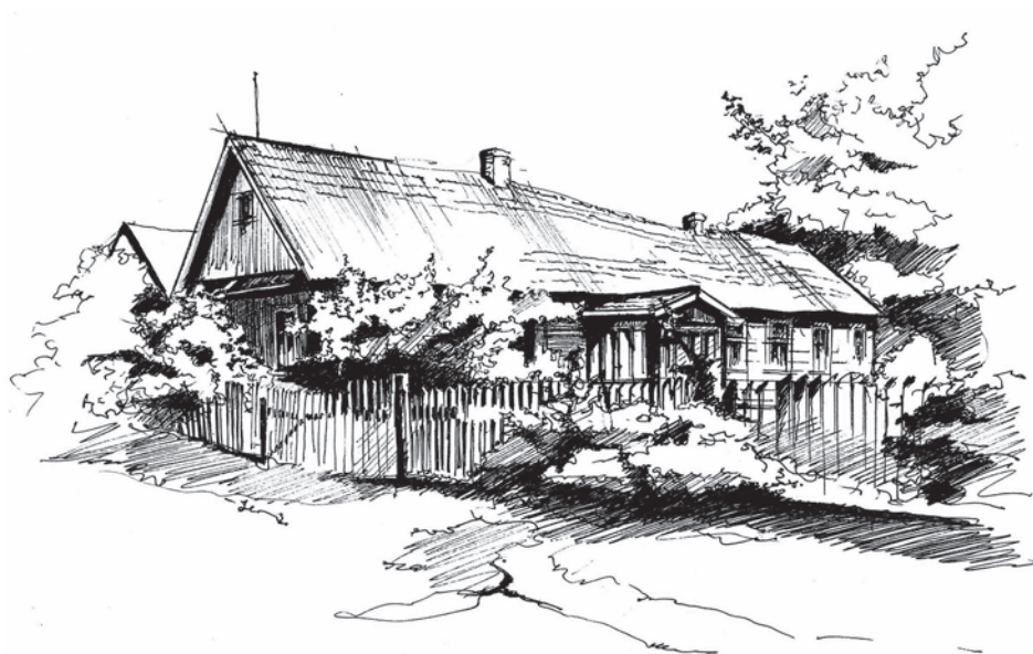
Fig. 1. Free-hand sketch of surveyed and mapped building, by Monika Maksimowicz