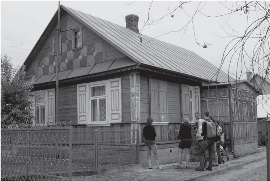
Fig. 4. Group patron's explanation concerning the precision of measurements.

the participants under supervision of professionals took pictures of landscape and architecture, individual buildings and decorative details from proper perspective.