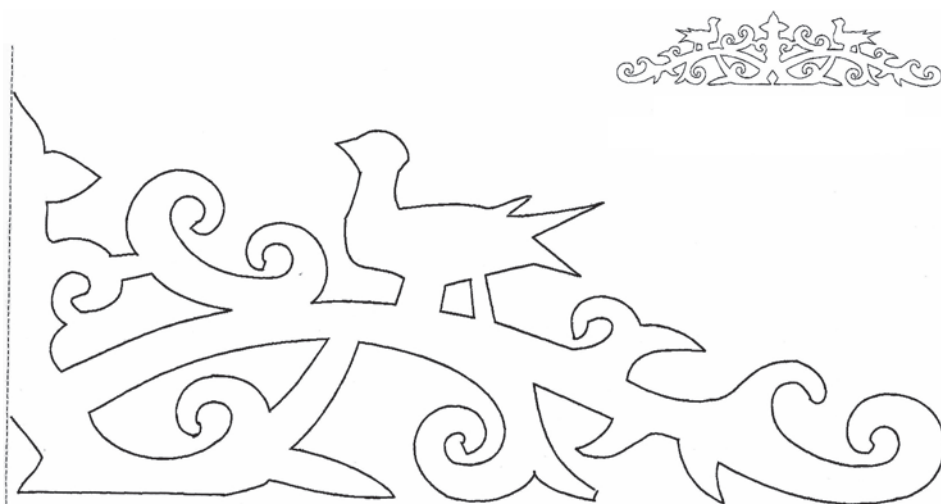
Fig. 3. Stencil-model of decorative window head, by Monika Maksimowicz [2]