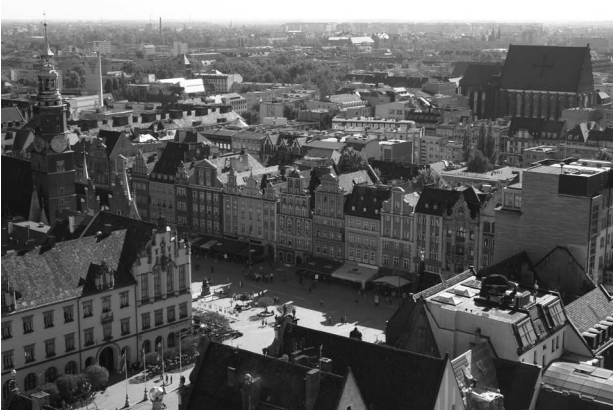
Fig. 2. Wrocław – a view on the south side of Old Town