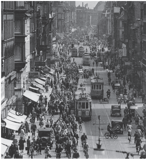
Fig. 1. Nørrebrogade Street in Copenhagen, 1953.

Il. 1. Ulica Nørrebrogade w Kopenhadze, rok 1953.