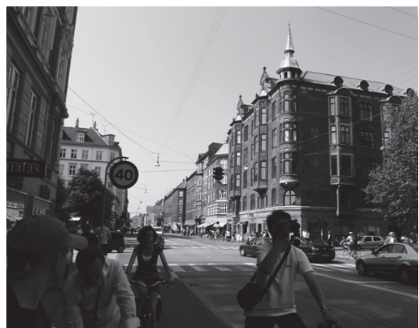
Fig. 4. Nørrebrogade Street in Copenhagen

Il. 3. Ulica Nørrebrogade w Kopenhadze, rok 1989.