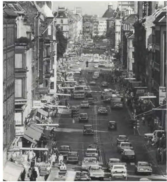
Fig. 2. Nørrebrogade Street in Copenhagen, 1973.

Il. 1. Ulica Nørrebrogade w Kopenhadze, rok 1953.