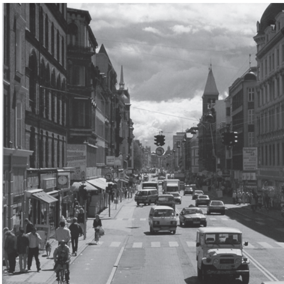
Fig. 3. Nørrebrogade Street in Copenhagen, 1989.

In the 1950s, Copenhagen witnessed the automobile revolution. However, it was not as intensive as in other