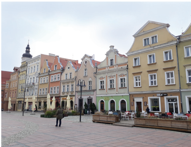
Fig. 8. The western frontage of the Market Square in Opole after the restoration.

articles on the restoration shows that archivists and historians were supposed to recreate, on the basis of iconographic materials, [...] the historic beauty of the Polish and "Opole's" Renaissance and Baroque architecture [32, p. 6]. In addition to recreating and restoring individual forms, the vital task was to reject other – in this case [...] foreign Prussian influences grounded in Berlin's Pseudoclassicism from Schinkel's and Langhans' schools of architecture ; the same ones which, when Opole had been passed into the hands of Prussia, [...] started to obscure the native Polish baroque distinctive of a particular hue found in Opole [32, p. 6]. However, the negative attitude towards the 19 th and 20 th -century alterations of cities under Prussian and German rule in the case of Opole