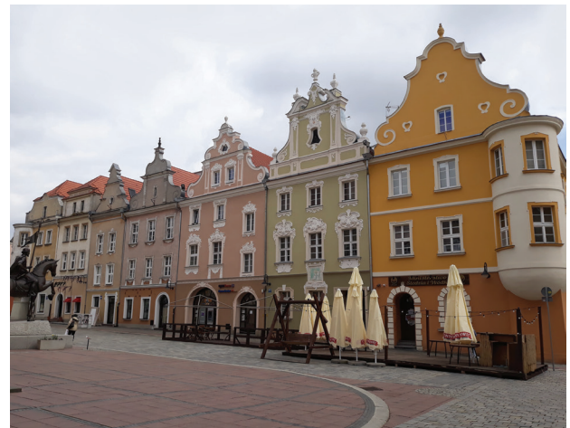
Fig. 9. The southern frontage of the Market Square in Opole after the restoration.

Il. 8. Pierzeja zachodnia Rynku w Opolu po odbudowie. Od lewej: kamienice nr 1–8 i fragment kamienicy nr 9 (fot. B. Szczepańska, 2021)