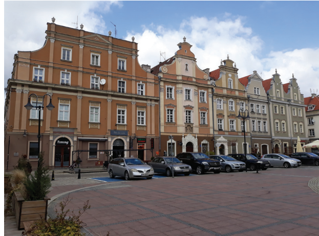
Fig. 5. The northern frontage of the Market Square in Opole after the restoration.

Il. 4. Pierzeja wschodnia Rynku w Opolu po odbudowie. Od lewej: kamienice nr 16–21 i fragment kamienicy nr 22