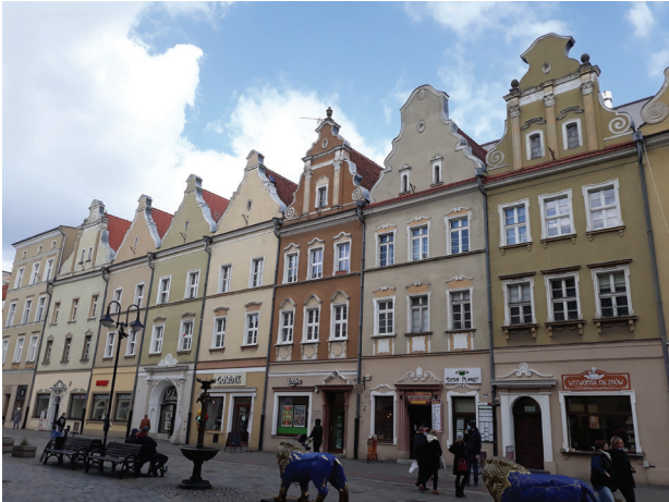
Fig. 4. The eastern frontage of the Market Square in Opole after the restoration. From the left: tenement houses nos. 16–21 and a fragment of tenement house no. 22

Il. 4. Pierzeja wschodnia Rynku w Opolu po odbudowie. Od lewej: kamienice nr 16–21 i fragment kamienicy nr 22