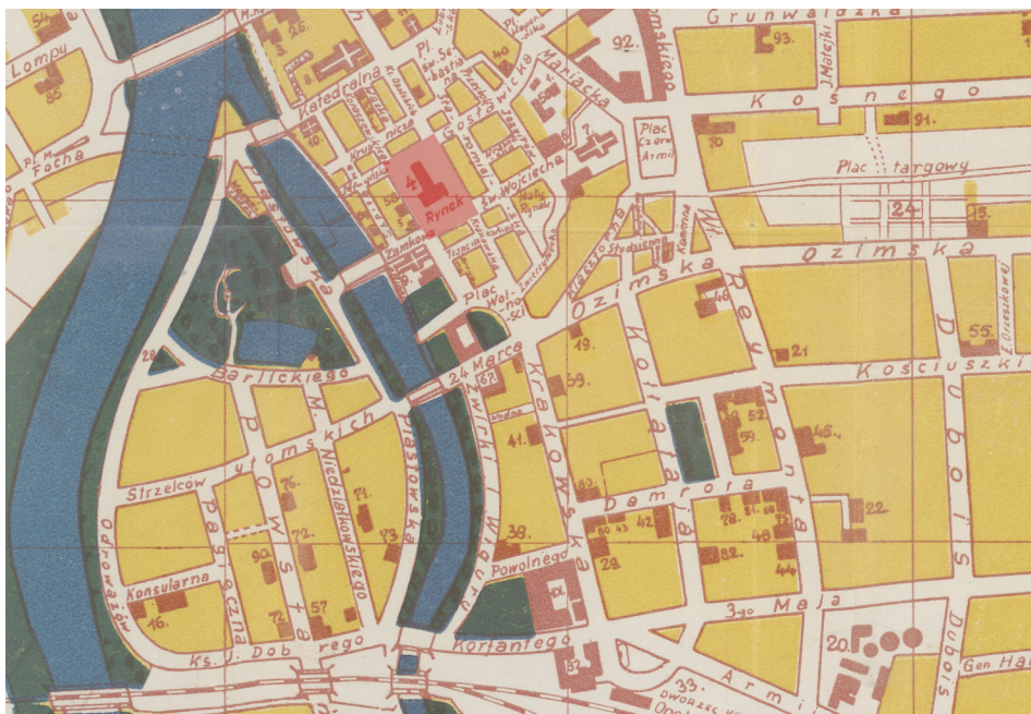
Fig. 1. A fragment of the map of the city of Opole from the Przewodnik po mieście Opolu , issued in 1948. The area of the Market Square is marked in red (source: [1])