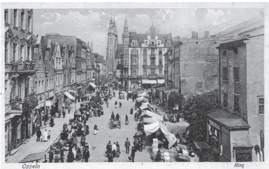
Fig. 6. The market square in Opole before 1945. The western frontage and a fragment of the northern frontage with the “Under the Black Eagle” tenement house. From the left: fragment of tenement house no. 3, tenement house nos. 4–10 (source: [31])

Due to the process of restoration, the Opole Market Square was to regain its “old, historical appearance” [17, p. 4]. The often-cited reference point of “historicity” of the architecture of the rebuilt Market Square forces us to