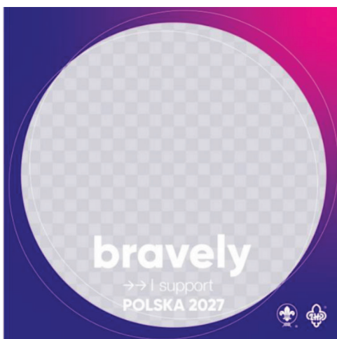
Fig. 2. Facebook profile picture frame

Every communication channel is designed in the same graphic layout, there is also a template for the infographics and Instagram/Facebook posts. 30 days before the World Scout Conference in August 2021, there was a Facebook profile picture frame (Fig. 2) released for scouts to show their support for the Polish Scouting and Guiding Association becoming the host of the 26 th World Scout Jamboree.