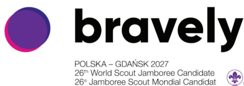
Fig. 1. Bravely logo

ball symbolizes the international scout family and the Earth itself, as it is called a Blue Planet. Magenta ball symbolizes inspiration, exuberance, power, and strength. Put together create the purple ball, that specific tint is the official color of the World Organization of Scout Movement. Purple ball symbolizes embodiment of the scouting and the jamborees – scouting power to change the world, and the world, which needs the change. It is as putting the ideas and values into the Earth and that is how scout movement arose. Full logo is shown on Fig. 1.