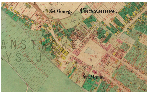
Fig. 5. Cieszanów on the Galician Cadaster from 1854

Il. 4. Cieszanów na I Zdjęciu Wojskowym, Mapie Galicji i Lodomerii z lat 1769–1783