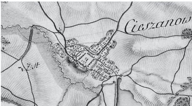
Fig. 4. Cieszanów on the First Military Survey – Map of Galicia and Lodomeria of 1769–1783

An analysis of Cieszanów's historical plans, namely that of the First Military Survey – Map of Galicia and Lodomeria of 1769–1783, the Galician Cadaster of 1848, the Second Military Survey – Map of Galicia and Bukovina from 1861–1864, when confronted with an up-to-date survey map and an orthophotomap (Fig. 6) allows us to state that, essentially, the Renaissance-period historical urban layout of Cieszanów has survived into the present. This observation concerns both the shape and size of the market square and the development blocks around it, especially the western, northern and southern ones. It should be noted that the fact that the town's historical develop-