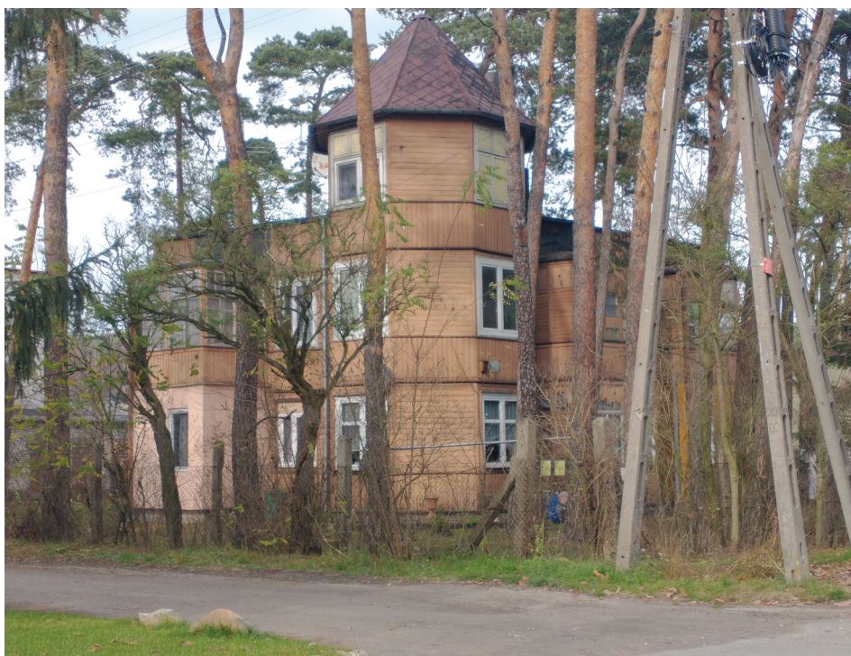
Fig. 4. Kolumna. A wooden villa with a corner turret at 14 Komuny Paryskiej Street

Il. 3. Kolumna. Drewniana willa z narożną wieżyczką przy pl. Szarych Szeregów 4. Na pierwszym planie zrewitalizowany plac z elementami małej architektury