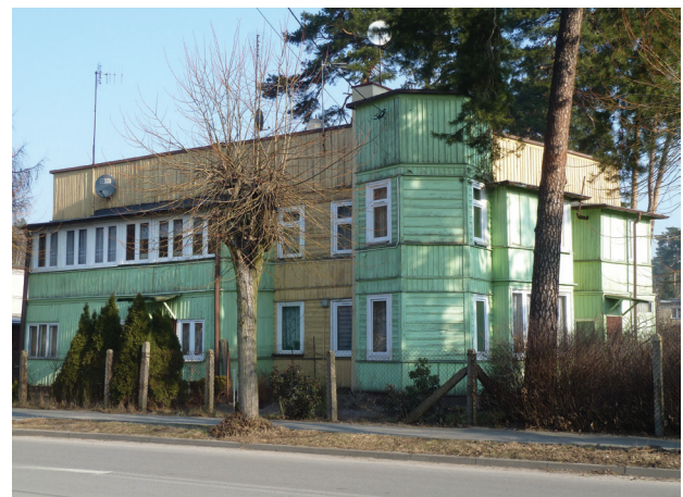
Fig. 6. Kolumna. A wooden building (former boarding house) with a corner turret with a roof with a slight inclination at 1 Wileńska Street

Il. 5. Kolumna. Elewacja willi przy placu Szarych Szeregów 4 od strony południowo-wschodniej. Niespójne fragmenty uzupełnienia ścian oraz okna po częściowej wymianie oryginalnych