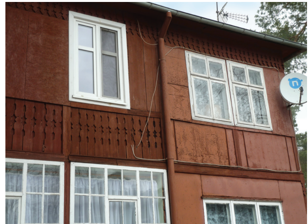
Fig. 5. Kolumna. Elevation of the villa at Szarych Szeregów Square 4 from the south-east. Inconsistent fragments of the walls and windows after partial replacement of the original ones

Il. 5. Kolumna. Elewacja willi przy placu Szarych Szeregów 4 od strony południowo-wschodniej. Niespójne fragmenty uzupełnienia ścian oraz okna po częściowej wymianie oryginalnych