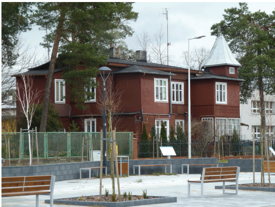
Fig. 3. Kolumna. A wooden villa with a corner turret at Szarych Szeregów Square 4. In the foreground a revitalized square with elements of small architecture

Il. 3. Kolumna. Drewniana willa z narożną wieżyczką przy pl. Szarych Szeregów 4. Na pierwszym planie zrewitalizowany plac z elementami małej architektury