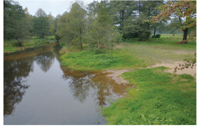
Fig. 12. Kolumna. Beach on the river Grabia. Currently neglected, overgrown with grass, no social facilities

In the case of Kolumna, in order to distinguish it from Łask's downtown, this zone is also described as a zone of protection of the historical spatial arrangement and historical functions [35]. However, current activities regarding both the modernization of facilities, maintenance and displaying of natural values seem to be very modest. The intensification of activities depends to a large extent on the possibility of obtaining funds, but also on the proper management of cultural heritage resources. It is advisable to revitalize and activate the area around Grabia, create a swimming pool with the accompanying infrastructure, establish a trail of wooden villas, revitalize the area in terms of recreation and tourism, strengthen the protection of forest resources. Kolumna should be equipped and rich in infrastructure focused on leisure and tourism. A revitalized area, such as Szarych Szeregów Square, is an example of a place that has been socially activated to some extent. In addition, the protection of the cultural heritage