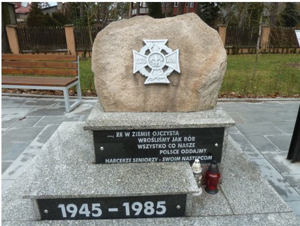
Fig. 11. Kolumna. The place of honoring the Gray Ranks located on the extension of the axis of Szarych Szeregów Square

Il. 11. Kolumna. Miejsce uczczenia Szarych Szeregów zlokalizowane na przedłużeniu osi pl. Szarych Szeregów