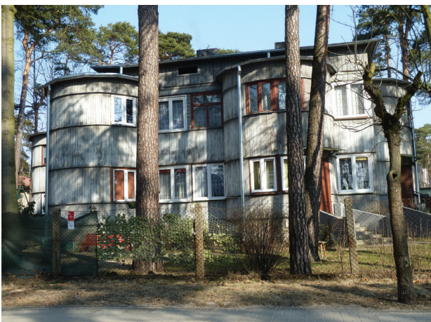
Fig. 8. Kolumna. The Rozenblats' wooden villa from the mid-1930s at 14 Wojska Polskiego Street. Window joinery after partial replacement does not refer to historical divisions

Il. 7. Kolumna. Drewniana willa przy ul. Wileńskiej 25 o rytmicznej elewacji