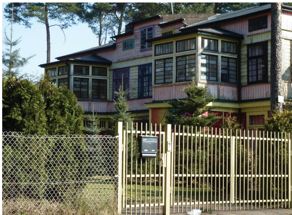
Fig. 10. Kolumna. A wooden villa with a characteristic glazed veranda from Szarych Szeregów Square side

Il. 9. Kolumna. Pensjonat przy ul. Wojska Polskiego 18. Zły stan techniczny budynku i elewacji