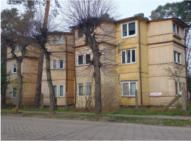
Fig. 7. Kolumna. Wooden villa at 25 Wileńska Street with a rhythmic façade

Il. 7. Kolumna. Drewniana willa przy ul. Wileńskiej 25 o rytmicznej elewacji