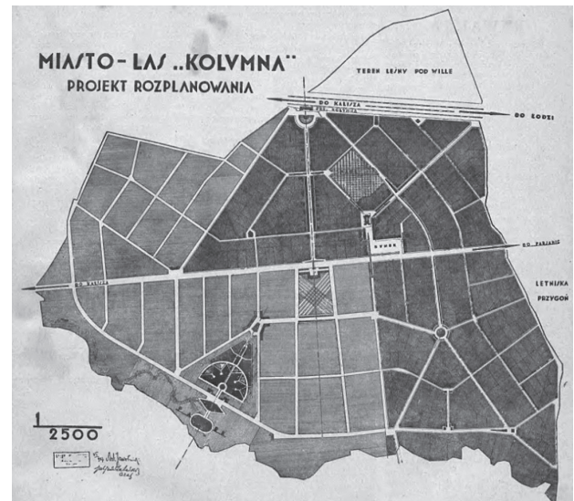
Fig. 1. Kolumna-Forest, development plan (1927, by A. Jawornicki, [28])

The establishment of the village was undoubtedly also due to its favorable geographical location on the rivers Grabia and Pałusznicza. In the years 1928–1929, forest areas