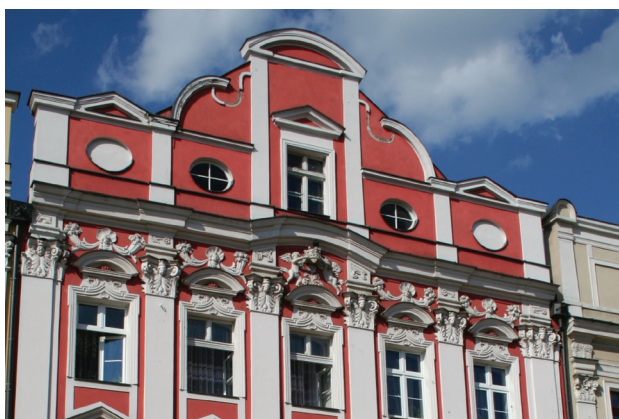
Fig. 7. Attic shielding the half hip roof of the building at No. 7 at the market square in Świdnica

II. 6. Częściowo zrekonstruowane dachy naczółkowe nad kamienicami w pierzei zachodniej rynku w Świdnicy