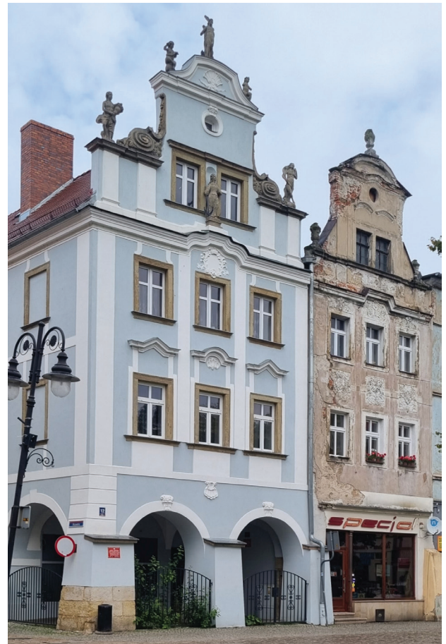
Fig. 4. Equilateral triangle-shaped roof gables with high plinths as fire walls on townhouses at the market square in Kamienna Góra

Il. 4. Szczyty dachów o kształcie trójkątów równobocznych i wysokich cokółach o charakterze ścian ogniowych na kamienicach przy rynku w Kamiennej Górze