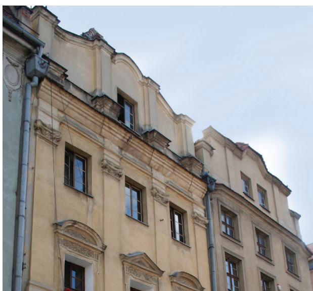
Fig. 8. Crowning of the townhouses at Nos. 6 and 8 Długa Street in Świdnica