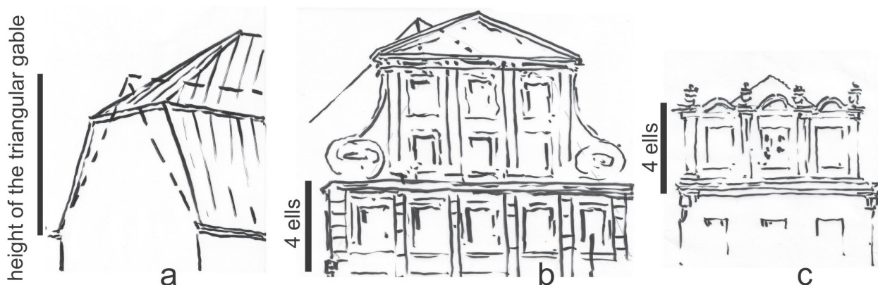
Fig. 2. Required by fire regulations: a) crowning of the half hip roof meeting the requirement not to exceed the height of the gable with the outlines of an equilateral triangle, b) a fire wall 4 ells high as the base of the gable and c) a fire wall of this height realised as an attic (elaborated by B. Ludwig)

II. 2. Wymagane przepisami przeciwpożarowymi: a) szczyt dachu naczółkowego wypełniający wymóg nieprzewyższania wysokości szczytu o zarysach trójkąta równobocznego, b) mur ogniowy o wysokości 4 łokci jako podstawa szczytu i c) mur ogniowy takiej wysokości zrealizowany jako attyka (oprac. B. Ludwig)