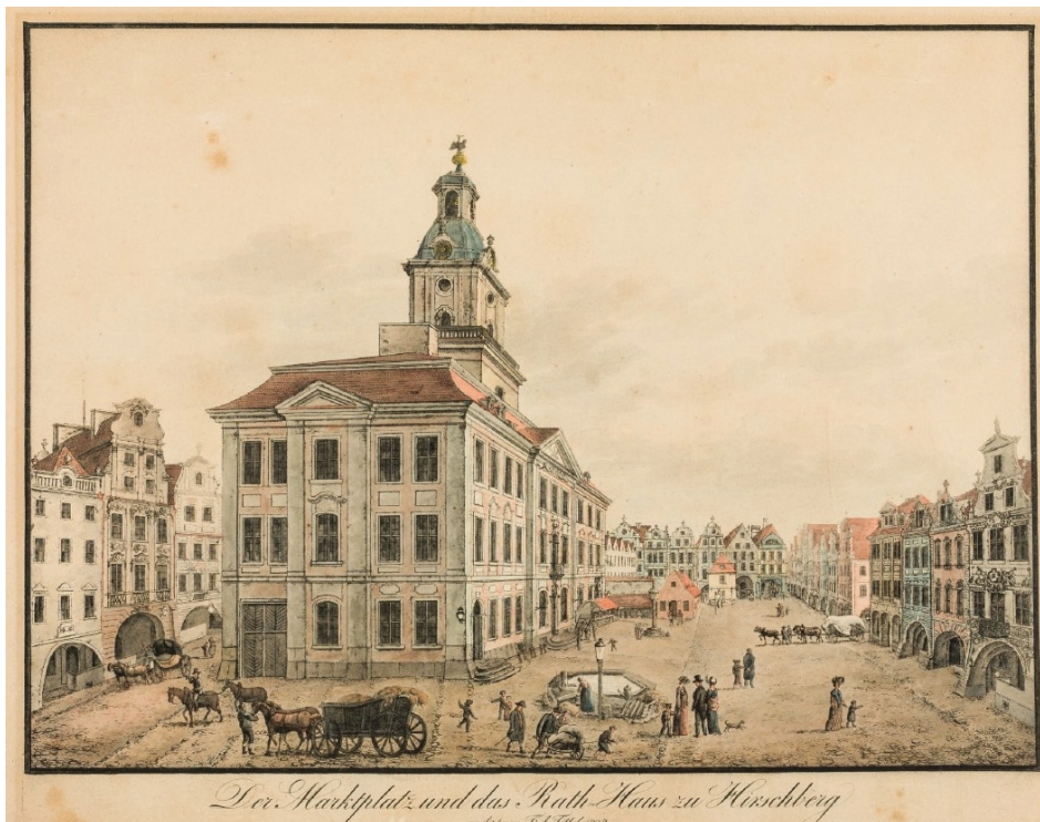
Fig. 3. The market square in Jelenia Góra showing buildings with high mansard roofs and hip roofs with attics on the F.A. Tittel's graphic (source: F.A. Tittel, Der Marktplatz und das Rath-Haus zu Hirschberg , Schmieberg 1828, oai:www.sbc.org.pl:410543)

Il. 3. Rynek w Jeleniej Górze z uwidocznioną zabudową z wysokimi dachami mansardowymi i dachami czterospadowymi z attykami na grafice F.A. Tittela (źródło: F.A. Tittel, Der Marktplatz und das Rath-Haus zu Hirschberg , Schmieberg 1828, oai:www.sbc.org.pl:410543)