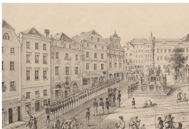
Fig. 9. Tenement houses with half hip roofs in the western frontage of the market square in Kłodzko in a graphic by E.W. Knippel

II. 7. Attyka osłaniająca dach naczółkowy kamienicy przy rynku w Świdnicy pod nr 7