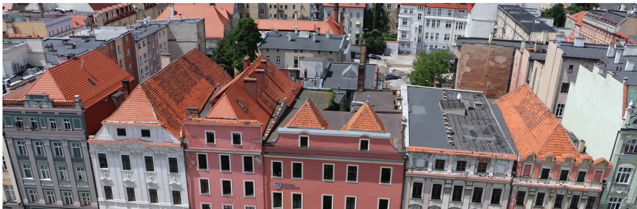
Fig. 6. Partially reconstructed half hip roofs over townhouses in the western frontage of the Świdnica market square

II. 6. Częściowo zrekonstruowane dachy naczółkowe nad kamienicami w pierzei zachodniej rynku w Świdnicy