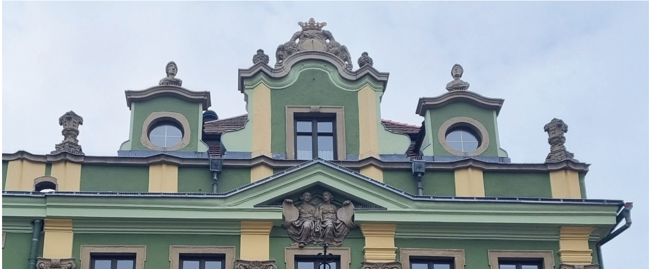
Fig. 10. Crowning of the hip roof of the tenement at market square No. 6 in Kamienna Góra (probably designed by M. Frantz the Younger)

Il. 10. Zwieńczenie czterospadowego dachu kamienicy przy rynku nr 6 w Kamiennej Górze (prawdopodobnie projektu M. Frantza Młodszeo)