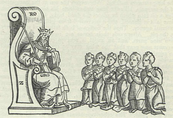
FIG. 14.-Allegorical representation of transmutation.

We will now look at one of the books which were cherished by the alchemists. Here is a little vellum-covered Aldus : date 1546. Paracelsus had been dead five years, and Cornelius