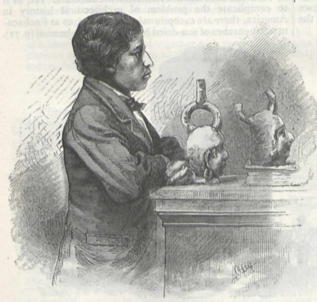
Fig. 4.—Ancient Vases and Modern Peruvian Heads.

whole width of the courtyard. Across the circle a line was drawn from east to west, and long experience had shown them where the two points should be placed on the circumference. They saw, by the shadow thrown by the column in the direction of the line, that the time of the equinox was approaching; and when the shadow was exactly on the line from sunrise to sunset, and the light of the sun bathed the whole circumference of the