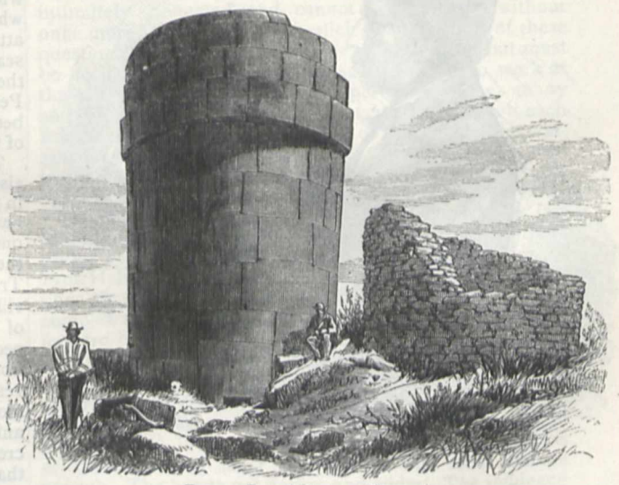
Fig. 2.-Round Chulpas, Sillustani.

chamber, vaulted with flat, over-lapping stones. This primitive arrangement of the "false arch," which reminds one of those which children make with their bricks, is usual in Peruvian as in Central American architecture. Yet, as if to complicate the problem of architectural history in America, there are exceptional cases where, as at Pachacamac, true arches of sun-dried bricks are still to be seen (p. 71).