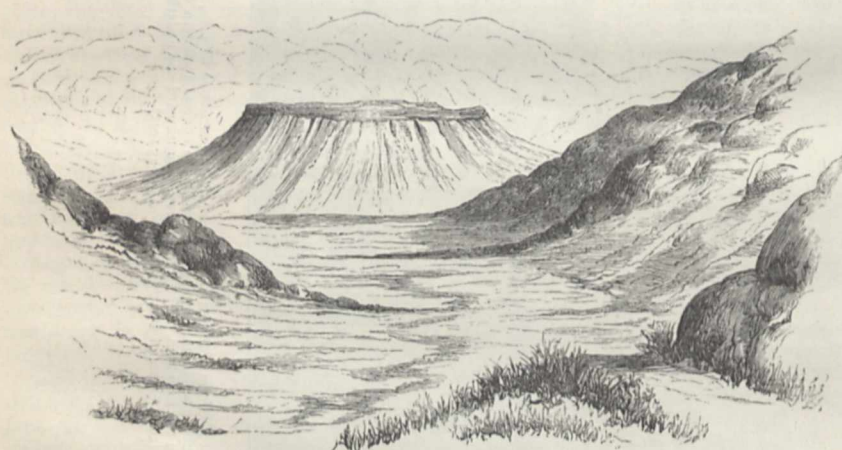
FIG. 3.—View of outlier of Cambrian breccia and sandstone among gneiss hills near Gairloch.

is sufficiently manifest. But if the peculiar bossy surface is to be thus explained we are confronted by the difficulty that the ice must have acted far more effectively on the gneiss than on any other rock in the region. Yet there is nothing in the configuration of the ground to make the erosion greater on the gneiss than on the red sandstone or quartzites and schists. The same side of a sea-loch may be seen to present slopes both of gneiss and sandstone; the gneiss is always worn into smooth domes, ridges, and hollows; but the sandstone retains its parallel bands of rocky terrace. The difference is evidently not due to any greater glacial abrasion of the gneiss. The area of high ground above the gneiss platform in Suther-