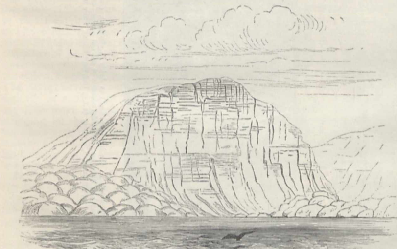
FIG. 2.—Ben Shieldag, Loch Torridon—a hill of flat Cambrian red sandstone resting upon an uneven hummocky surface of the old gneiss.

Every fresh excursion into these northern wilds has increased my difficulty in accounting for the peculiar contours of the gneiss ground by reference merely to the work of the Glacial period. A recent visit, however, seems at last to have thrown some light on the matter. I had long been familiar with the fact that the platform of gneiss on which the red sandstones and conglomerates were laid down abounded in inequalities even at the time of the deposit of these strata. Its uneven surface rose here and there into high ridges and cones, of which Stack is a diminished representative, and sank into depressions now occupied by thick masses of sandstone. But I have lately observed that not only do these larger features pass under the sandstone, but that the minor domes and bosses of gneiss do so likewise. On both sides of Loch Torridon, for example, the hummocky outlines of the gneiss can be seen emerging from under the overlying sandstones