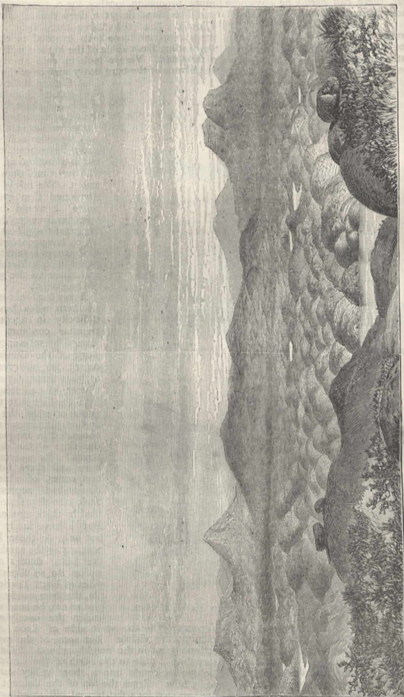
FIG. 1.—View of the ancient platform of gneiss looking eastward from above Scourie, Sutherlandshire. The hill to the left (one bird) is Arkle (2,580 feet), composed of quartzite resting on the fundamental gneiss, and dipping eastward; the conical mountain Stack (2,364 feet, marked here by two birds) consists of the old gneiss—the highest elevation reached by this rock on the mainland. The gneiss sweeps southward and underlies the great conical mountain of Queennag (2,653 feet, four birds), while in the distance (three birds) are seen the quartzite heights of Ben More Assynt (3,235 feet).

There is thus a special historical interest in this fragment of the old gneiss country. It is a portion of the