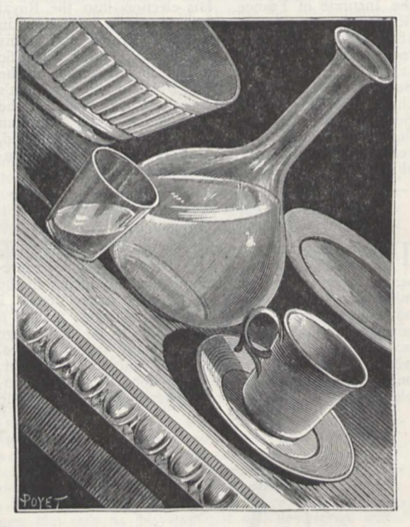
Fig. r.—Position in which household utensils furnished with india-rubber may be placed without falling.

India-rubber is known to oxidise under exposure to air and light; above all, under alternations of dryness and damp. By subjecting it, however, to a special operation, called vulcanisation, a product is obtained which main-