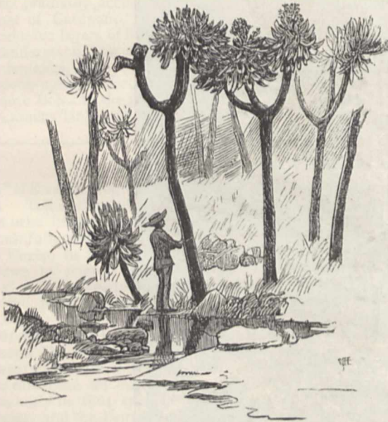
FIG. 2.— Senecio Johnstoni .

from the Nuba group, as the Nuba has already been separated from the Fulah of Western Sudan; and thus there is at last an end of Friedrich Müller's "Nuba-Fulah family," which has hitherto figured so largely in treatises on African philology. Its place is taken in East Central Africa by the Bari-Masai group, which Mr. Johnston now proposes to constitute, and which includes, as intervening members, Latuka certainly, Lango, Sûk, and Samburu more doubtfully.