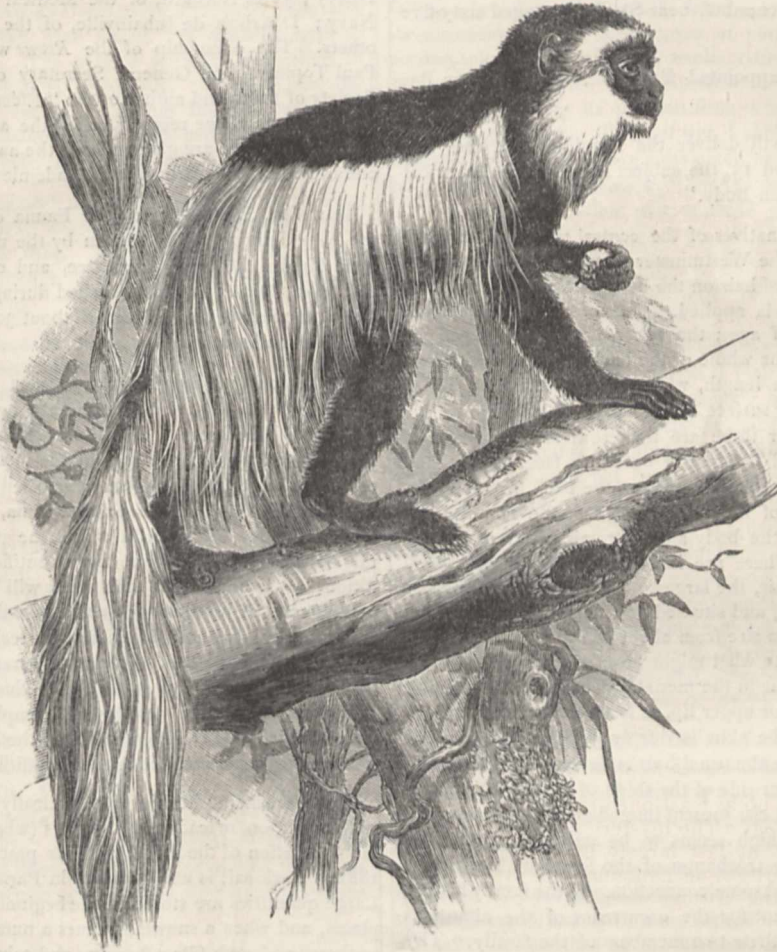
FIG. 4.— Colobus guereza , var. caudatus .