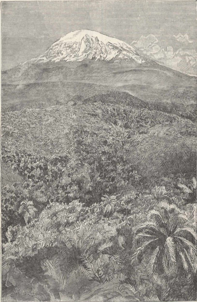
FIG. 1.—Kilima-Njaro seen from above Moshi ("Palms and Snow").

Amongst the valuable animal specimens secured by our naturalist was one of the new and beautiful species of Colobus ( C. guereza , Rüpp., var. caudatus , var. nov., Fig. 4) first seen and described by Mr. Thomson, which