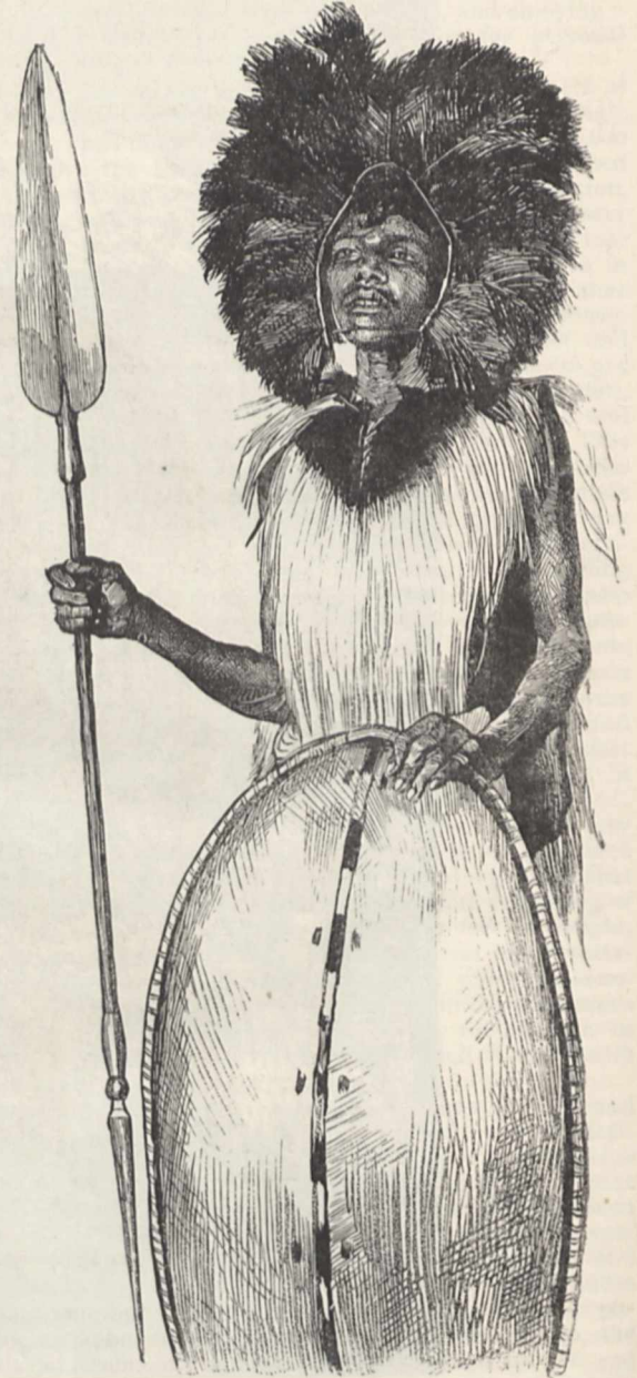
FIG. 3.—A Masai Warrior.

relations, which fills up at least one great gap in the field of African anthropology. The mystery hitherto surrounding the Masai race is at last largely dissipated, and we are now enabled with some confidence to assign them their true place in the African family. A careful comparative study of their language and physical type clearly shows that their affinities are to be sought amongst the Negro or Negroid peoples of the White Nile, and more particularly the warlike Bari nation of the Gondokoro district. From this basin they appear to have gradually spread in comparatively recent times south-eastwards between the Victoria Nyanza and the coast, encroaching to the east on the Hamitic Gallas, to the south on the Wa-taita, the Wa-chaga, and other outlying branches of the Bantu family. The annexed graphic illustration of a Masai warrior (Fig. 3) betrays some unmistakable Negro features, especially in the short nose, broad nostrils, and thick lips standing wide apart. On the other hand, the close relationship of the Masai and Bari languages is here clearly established, one of the most striking features common to both being true grammatical gender, as indeed had already been pointed out by Lepsius in his Nubian Grammar. Masai must consequently now be separated