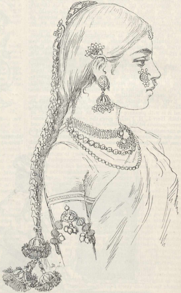
FIG. 4.—A Tamil woman from Trichinopoly.

It is convenient for European ethnologists that these objects are in such an accessible Museum as that in Berlin; but we, as Englishmen, would like to see the ethnography of all our British colonies as fully represented in our own National Museum. It is true there does not at present exist any machinery for making special collections, nor was there in Berlin until enthusiasts like Dr. Bastian and others created it. There are difficulties with regard to funds and storage-room; perhaps Dr. Bastian's plan of ignoring these problems