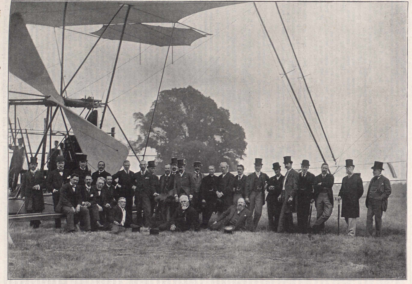
Fig. 2.—One of the screws, showing the connection with the engines.