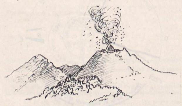
FIG. 2.—Vesuvius as seen from San Georgio a Cremano before the eruption (commencement of July).

M. Bourdariat's plan of the summit of the great cone, constructed on one of mine of earlier date, shows the axis of the new eruptive cone is not concentric, but to the northwest of the 1891 crater. This he attributed to the wind, no doubt one of the causes at work, but I had seen such displacement to be the case in November last, when from the depth of the cone top within the enclosing crater walls these sheltered the falling cakes from the wind. There was evidently even then the radial fissure directed to the north-west in process of formation, which has now been the point of issue of this new eruption.