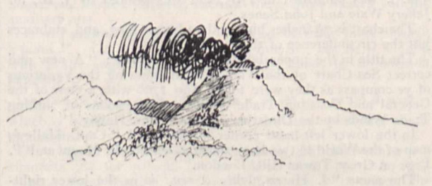
FIG. 4 -Vesuvius as seen on July 5, at 10 a.m.

crateriform appearance, as in the case of the upper one, and on other similar occasions a jet of steam, that constitutes the excavating agent, was converted into a blackish column by the lapillæ, sand, and dust dislodged and carried up with it from the side of the mountain. There is certainly some discrepancy in Mr. Treiber's report, for Mrs. Guppy's sketch, made at ten o'clock, shows this lower bocca already in existence. Her sketch likewise exhibits the progress of truncation of the central eruptive cone by the formation within it of a crater. Such a crater is entirely due to the crumbling in of the edges and their fall down the chimney, as no explosions were going on by the top part of the main chimney. Lava continued to pour forth from the lower end of the lower crateret, and probably from a part of the radial fissure that reached the surface below it, but which of course is hidden by the flowing lava. The stream reached the bottom of the great cone at the junction of the Atrio del Cavallo and the Piano di Genista, and then extended towards the upper end of the ridge of the Lion's Paw, or I Canteroni, where was once the old Crocelle. Here it soon formed a fine stream 60 m. Besides the two main craterets, already in breadth.