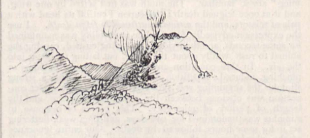
FIG. 3.-Vesuvius as seen on July 3, at 10 a.m.

At 10.30, about 70 m. lower down, a fresh eruptive mouth was opened, and is well seen in Fig. 3, having an oblique