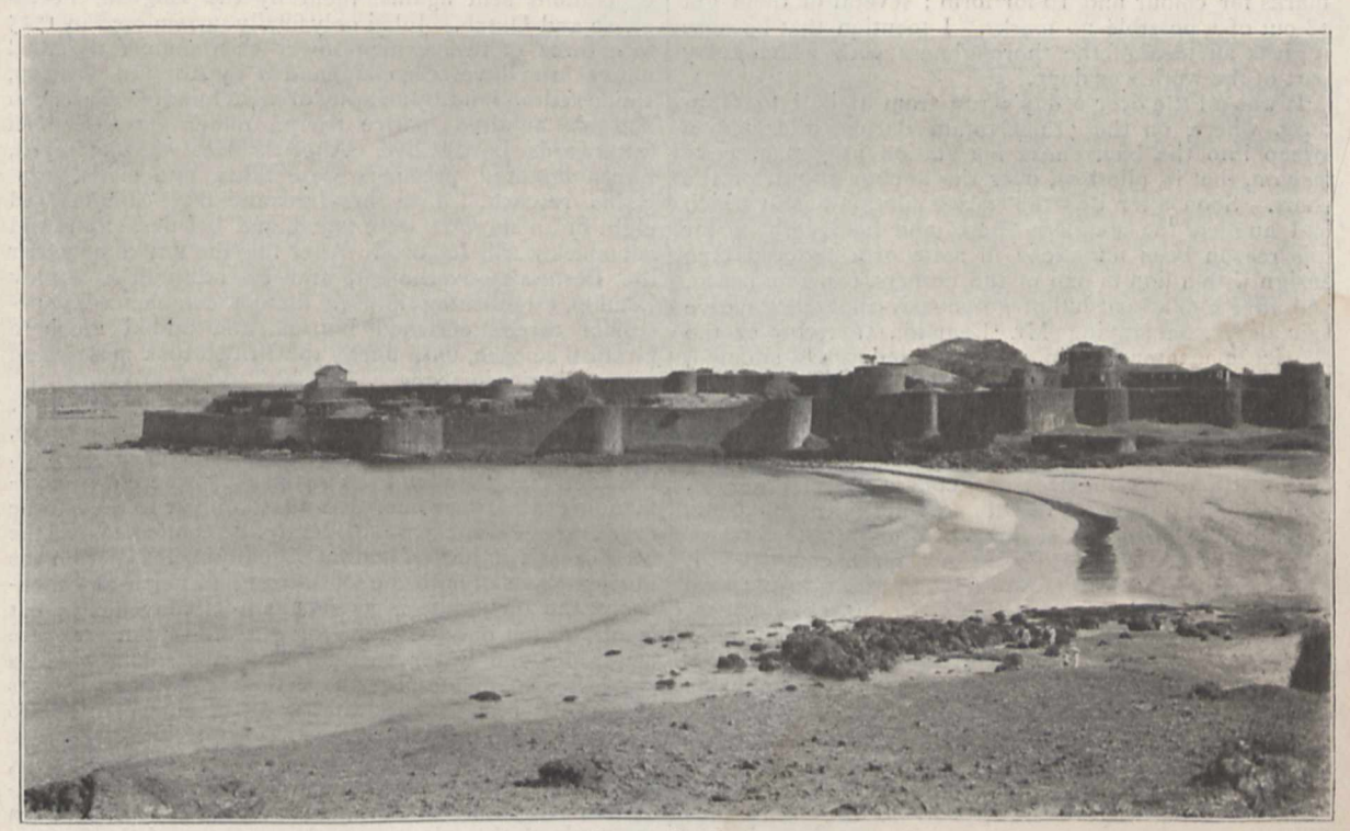
Fig. 1.-The Fort

teaching was put into a very big commission.