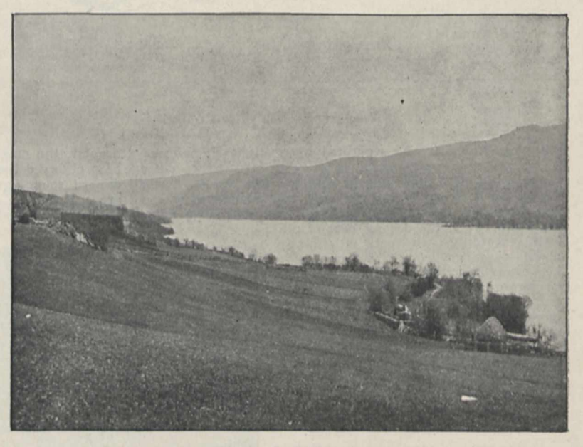
FIG. 3.-Loch Tummel.

Loch Lyon is extremely simple in outline and in conformation. It is nearly uniform in width, except for a cone of alluvium laid down by the river on the south-eastern shore. The lower (north-eastern) end is shallow, as though it had