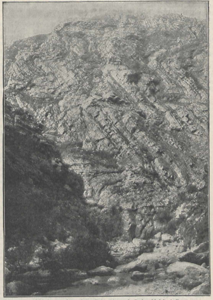
FIG. 1.—Overfolded quartzites of the Table Mountain Series, Meiring's Poort, representative of the great upheaval, which probably took place in early Jurassic times. From Rogers's "Geology of Cape Colony."

The Dwyka beds, a facies of the Kimberley-Ecca series, and long regarded as volcanic tuffs, are here