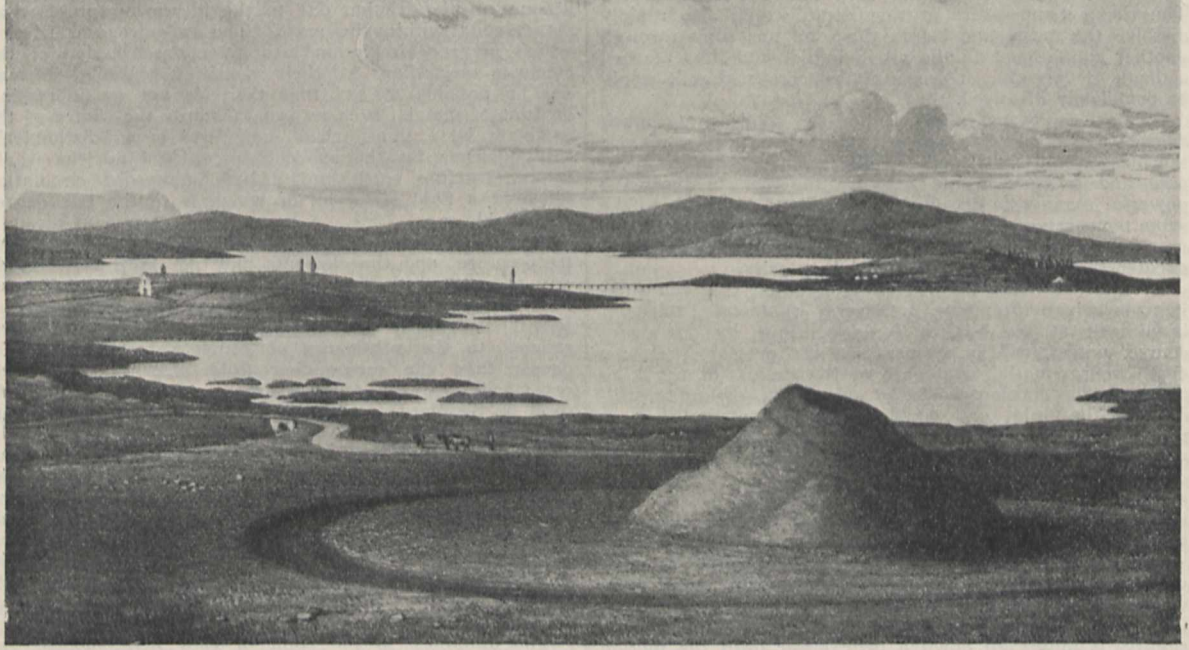
FIG. 14.-Maeshowe, in the foreground, and the Stones of Stenness. From "Notice of Runic Inscriptions," by James Farrer, M.P. (1862).

I give a copy of the Ordnance map showing the true orientation of these and of other sight lines I