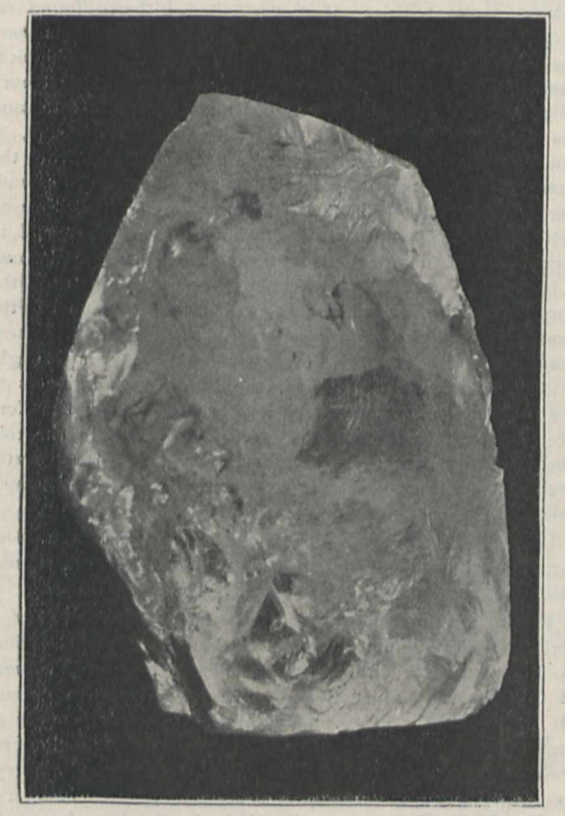
FIG. 1.-View of the Cullinan Diamond. Actual size.