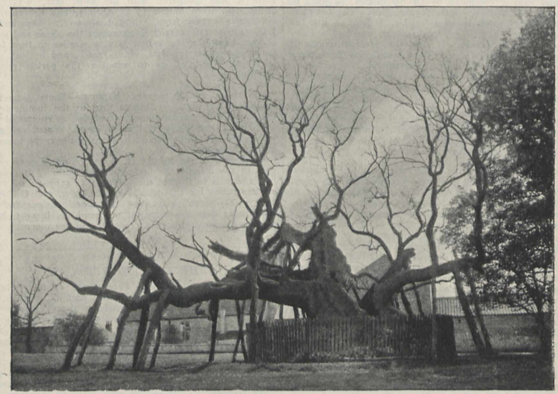
Cowthorpe Oak, seen from North. The tree is supported by twenty-five props, disposed mostly on the South and East sides. There is a paling about 5 ft. high, which seems as if it had been put up from twenty to forty years ago.

As regards the longevity of trees, the theory was promulgated at the beginning of the nineteenth century by De Candolle that the duration of life in trees was practically unlimited, neglecting accidents due to unfavourable external conditions, such as the ravages of parasites, injuries from storms, lightning, and other causes. Passing in review the vegetable kingdom, we find there are some lowly organised plants, such as certain algæ and fungi, the whole life cycle of which may be completed within the short space of a few days, or even hours. Among the higher plants we have annuals and biennials the existence of which terminates with the production of seed. Then we have the agave and certain palms, the