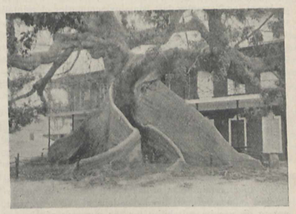
Fig. 1.—The Giant Ceiba Tree of Nassau—one of the famous trees of the World.

The order Bombacaceæ, united by Hooker with Malvaceæ, includes, besides the baobab, several remarkable trees, of which the "silk-cotton" trees are a