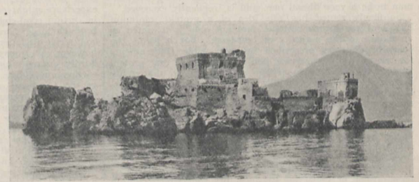
Fig. 2.-Revigliano from the south-east.

Sarno-Castellamare plain. The granitoid and Filonian Rocks of Sardinia form the subject of a posthumous memoir of Carlo Riva (No. 9, 108 pp., 7 pls.), which has been prepared for the press by his friend and colleague Prof. de Lorenzo. After describing the petrographical characteristics of the chief varieties of rock in detail, the author gives a valuable account of seventeen localities in Sardinia where zones of contact between the granites and schists and calcareous rocks may be well studied, together with an appreciation of the meta-