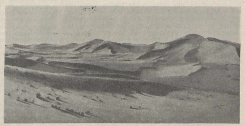
FIG. 1.-Large sand-dunes in the Erg region, Sahara.

The meteorological or climatic observations are particularly welcome. These observations are, of course, spread over a large area, and it is not the climate of any one district that is presented. Con-