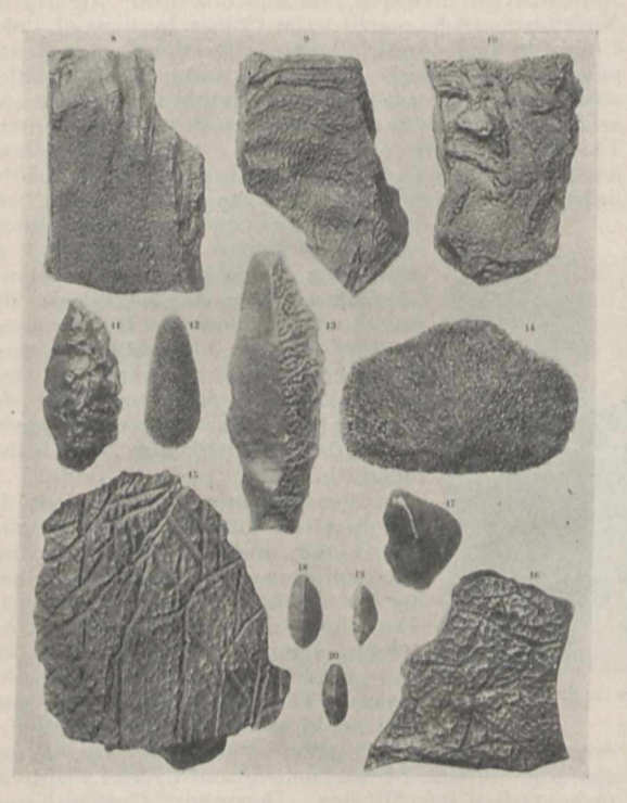
FIG. 3.—The larger specimens illustrate the fine fretted patterns produced on the surfaces of limestone rocks by the continued action of impinging sand grains driven by the wind. The four smaller specimens (17, 18, 19 and 20) illustrate the wearing down of fragments of siliceous rock, acted on by the natural "sand-blast." These are similar to those described by Mr. Enys from New Zealand.

At a place called Tindesset, about 764 miles due south from Philippeville, there is found a series of