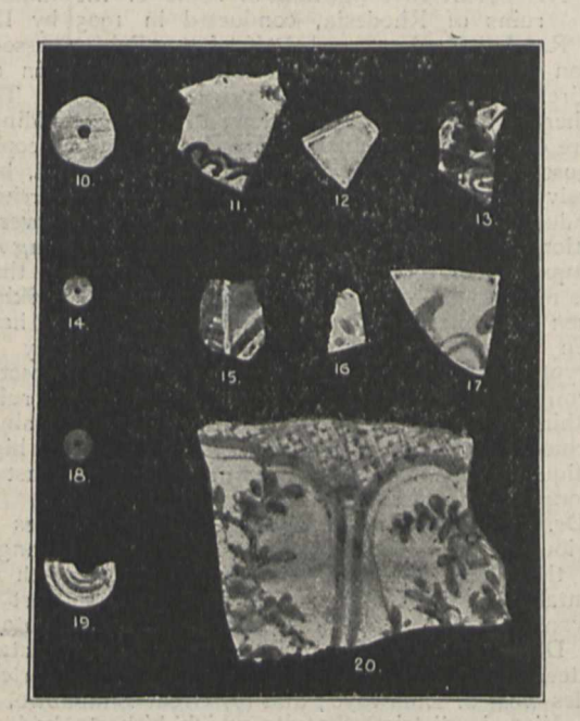
Fig. 1.—China and Ivory and Shell Beads found at Dhlo-Dhlo. Fiom "Mediæval Rhodesia."

tion is that none of these buildings are referable to an earlier period than mediæval or post-mediæval times. He argues that none of the objects hitherto discovered in excavating within the area of the ruins would be recognised by an archæologist as "more than a few centuries old; and that the objects, when not immediately recognisable as mediæval imports, are of characteristically African type." Inyanga and the Niekerk ruins do not appear to have produced any but native African objects, and at Umtali a fragment of glazed stoneware was the only foreign object found. At the better-known sites, Dhlo Dhlo, Kami, Nanatali, and Zimbabwe, a fair number of imported objects have been found, but here again Dr. MacIver holds that in no case is there evidence of a pre-mediæval antiquity. As far as possible, he endeavoured in his excavations to reach the lowest strata, and to explore the levels which must be contemporary with the earliest portions of the walls of the buildings, and the objects found therein were naturally considered by him of the highest importance.