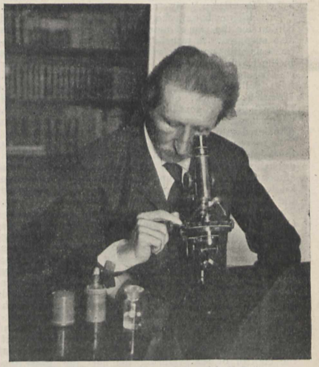
Prof. E. Strasburger.

The principal windows of the laboratories and of the residence overlook the palace garden, which has been the botanic garden since the founding of the university. The garden, though small in area, is well stocked and rich in flowering plants. The latter occupy the central part of the grounds, which are carefully laid out and arranged according to the system of Eichler. On either side of the central part is the arboretum, containing many fine specimens of European and some American trees. The arboretum is rich in conifers, one, a cedar of Lebanon, being unusually large and beautiful. A portion of the old palace moat is maintained as a pond for aquatics. The large palm house, the Victoria house, and other greenhouses contain many interesting exotics. The garden has also its special beds of poisonous, economic and medicinal plants, as well as one con-