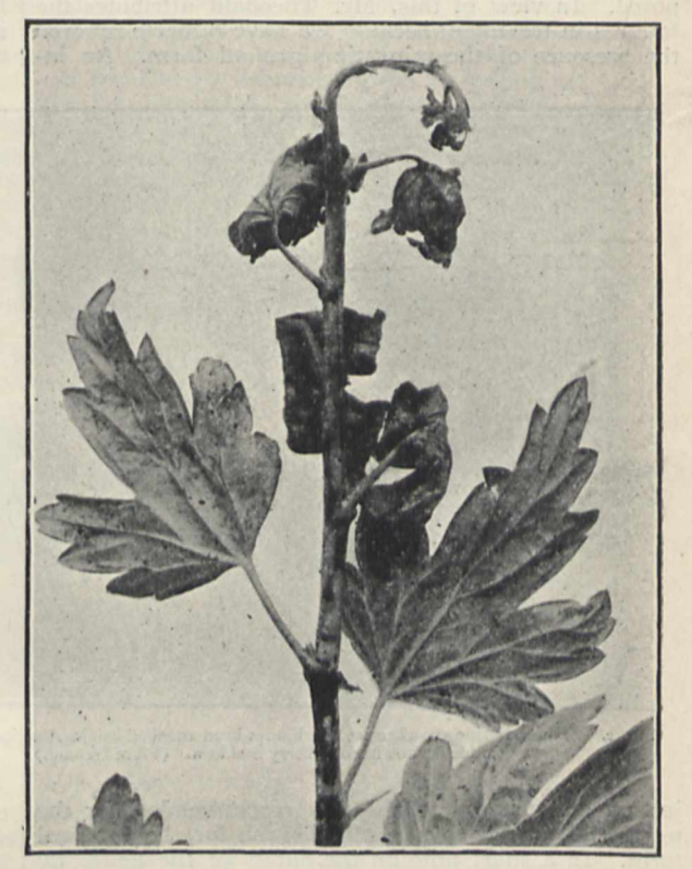
FIG. r.—Gooseberry shoot attacked by the American Gooseberry-mildew numerous dark scurfy patches of the spawn of the mildew can be seen on the stem.

N<sup>O</sup> better evidence can be adduced of the growing interest in agricultural education and research in this country than the support which has been given to them by the county councils of Surrey and Kent during the last few years. They have materially promoted the science of agriculture and horticulture by furnishing the necessary means for the annual publication of such valuable reports as the one which