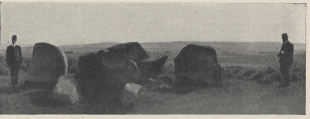
FIG. 22.-Contrasting the directing stone and supporters at Ardlair.

This is an argument in favour of the erection of the May-year circles before the solstitial ones at Midmar, Sunhoney and Stonehead, which have been left intact.