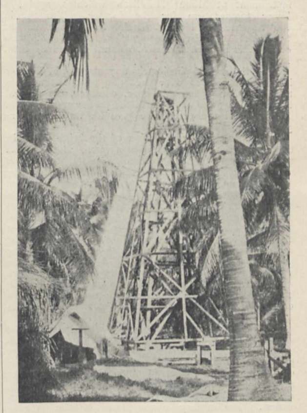
FIG. 1.-The 40-ft. Coronagraph.

on stellar temperatures. This principle depends upon a comparison of the relative amounts of the ultraviolet and the red radiations in the light-sources examined, predominance of the former denoting higher, and of the latter lower temperature. In Lockyer's stellar work it was found that by the assumption of this law the previous results depending upon the chemical classification of the stars were plenarily confirmed, and Prof. Lewis's conclusions are no less regular. Comparing the coronal with the solar spectrum, he finds that the latter is, relatively, much richer in violet light, and says, "hence it may be inferred that the corona is considerably colder than the sun." Subsequent comparative tests with a standard candle, allowing for the atmospheric absorption of the ultra-violet radiations, fix the lower limit of coronal temperature at considerably more than 2000° absolute.