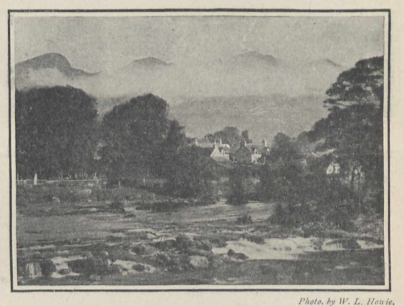
FIG. 1.-The Killin Hills, from the Dochart. From "Geology and Scenery of the Grampians."

The second volume begins with a description of the