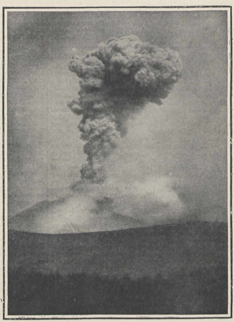
Eruption of Mount Asama, Japan. From "The Romance of Modern Geology."