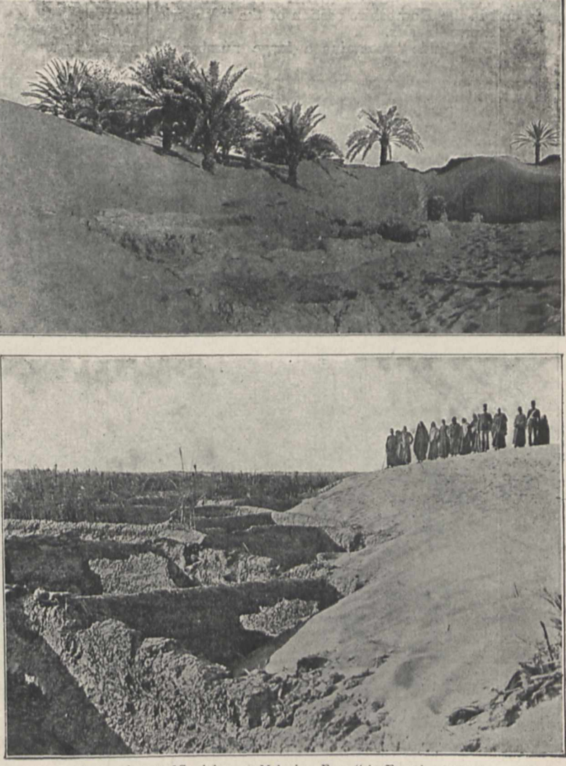
Encroachment of Sand-dunes at Meheriq. From "An Egyptian Oasis."

Persian rule, Cambyses sent an ill-equipped expedition to conquer the oases, but the whole army of 50,000 men, probably through the treachery of guides, perished miserably in the desert. The Romans long held sway in the oases, and many of the most remarkable of the monuments of the district must be referred to the period of their rule. The work before us indicates the great numbers of objects of archæological interest which are found in the district, including many Græco-Roman temples and a wonderful early-Christian necropolis, as well as very early