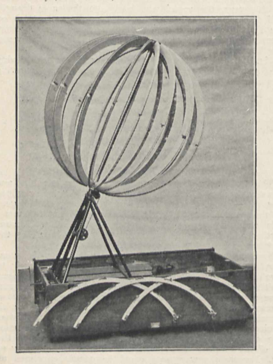
FIG. 1.-Meridians in place.

complete relief of the solid crust. Other surface sections are available; first, political sections showing by divers colours the great world empires, the railways, the rivers, and the ocean and cable routes;