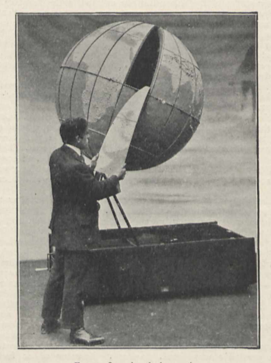
FIG. 2.-Inserting the last section.

Many little devices suggest themselves at once whereby the main factors of the earth's climatic conditions might become more real; it will suffice to suggest one use of a slightly different nature; the room is darkened, the rays from the lantern are centred accurately on the model, questions of local time and sun time are discussed, and with a needle to represent a stick the shadow exercises so common in school work in the playground are repeated on the globe, with this advantage, that the graph obtained to show the sun's altitude, which took the whole of one school year to make, may now be made in a shorter period, when the work may be carried through without a break. The inventor may be congratulated on the way in which he has surmounted many mechanical difficulties, and in