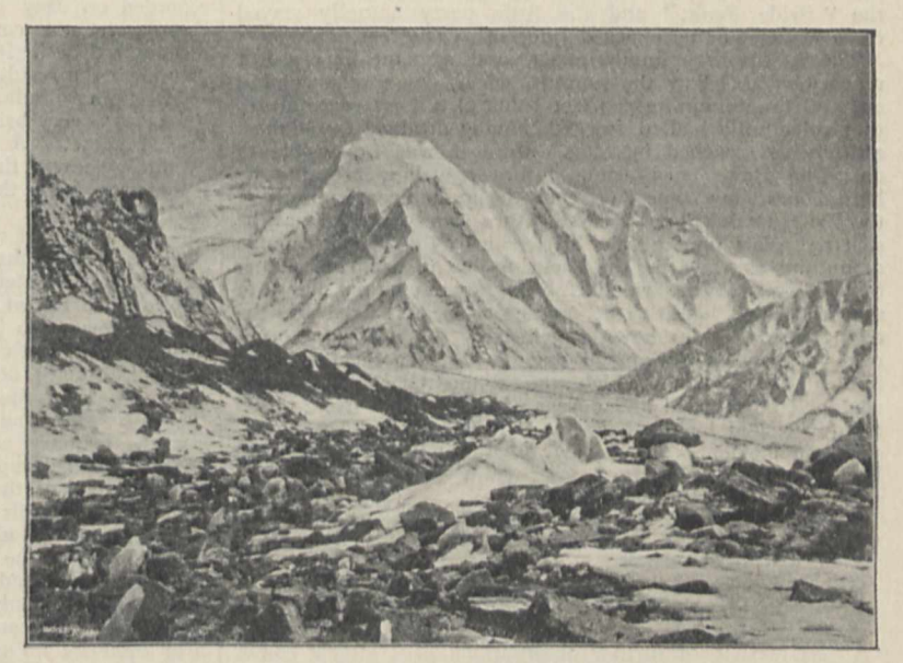
FIG. 2.-The Bride Peak.

to be cut all the way up to the summit. The Tibetan side presented a pre-cipitous wall of rock; beneath was a glacier flowing west to the Oprang Valley, probably a tributary of the glacier descending from the Mustakh Pass. As the Duke describes it, the northern flank of K2 seen from that side must form a gigantic wall nearly 10,000 feet in height. Seen well from here, K2 was deemed impracticable for the Alpine climber. The explorers next attacked the eastern side, and