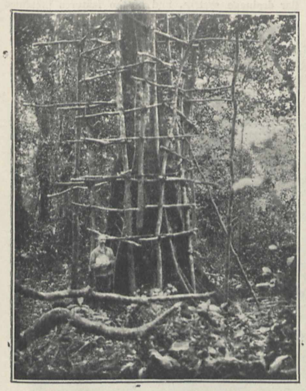
Fig. 2.—High-tapping Funtumia (Mabira Forest). Art of Rubber Growing." From "The Whole

side of the rubber industry, and is mainly of interest