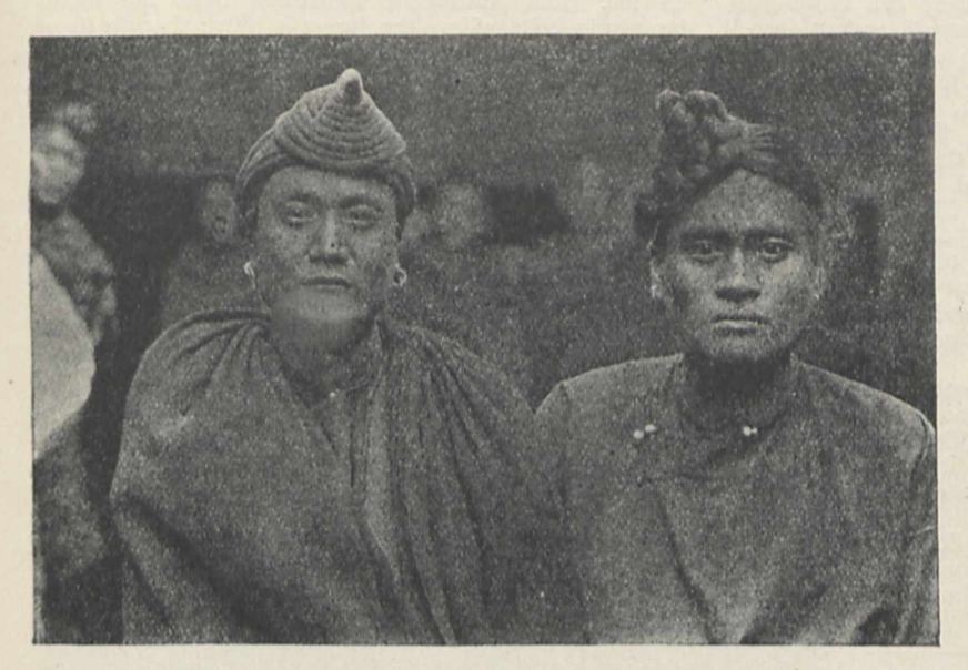
Fig. r.-Lolo Chief hostages. From "Adventure, Sport, and Travel, on the Tibetan Steppes."

THIS book deals mainly with the little-known Lolo and neighbouring tribes in western China, who are believed to represent some of the pre-Chinese abori-