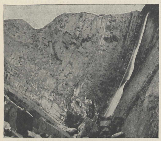
Fig. 2.—The First Fall of Milford Water and the synclinal fold, looking north. From "The Coast Scenery of North Devon."

Part ii. of the book deals with some features of special geological interest, these being the marine erosion of folded rocks, sea-dissected valleys, and the evolution of coastal waterfalls. The author points out that the usual text-book explanation of bays and promontories along a sea-coast is not always the true one. They do not always coincide with the outcrops of softer and harder rocks. Some of the irregularities of the Devon coast seem to be due to the influence of previously existing physiographic features, the bays coinciding with the sites of valleys and the promon-