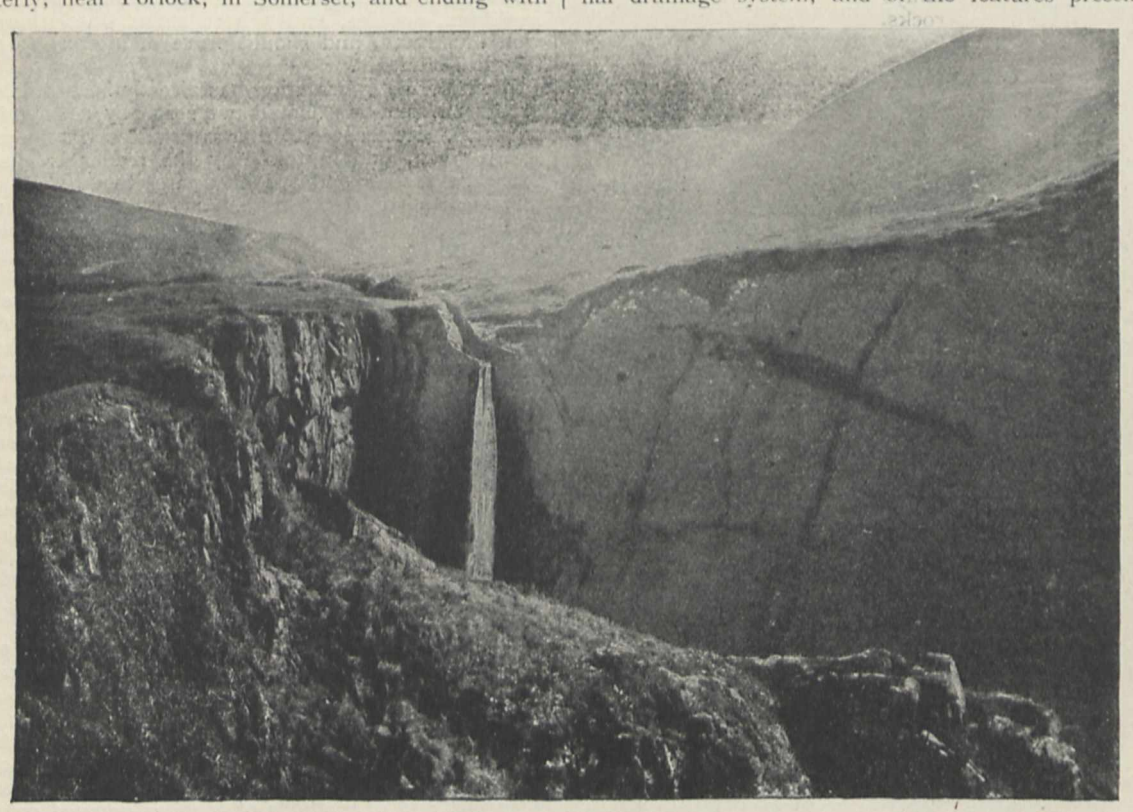
Fig. 1.—The valley of Milford Water and the head of the First Fall, from the cliffs above Speke's Mill Mouth, looking east (Hartland District). From "The Coast Scenery of North Devon."

This comparatively recent subsidence is a very important factor in the explanation of the present peculiar drainage system, and of the features presented