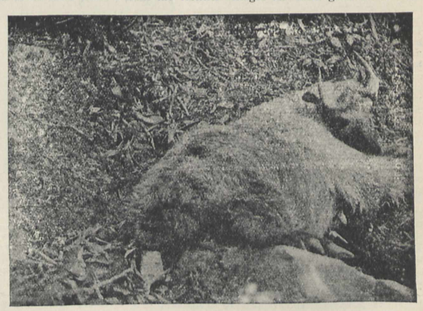
Fig. 2.-Takin (Budorcas sp.). From "Adventure, Sport, and Travel, on the Tibetan Steppes."

now adds much that is both new and interesting. These wild Lolos have hitherto preserved their independence, though in order to repress to some extent their habitual bloody raids into settled Chinese territory, hostages are taken from the frontier villages for their good behaviour.