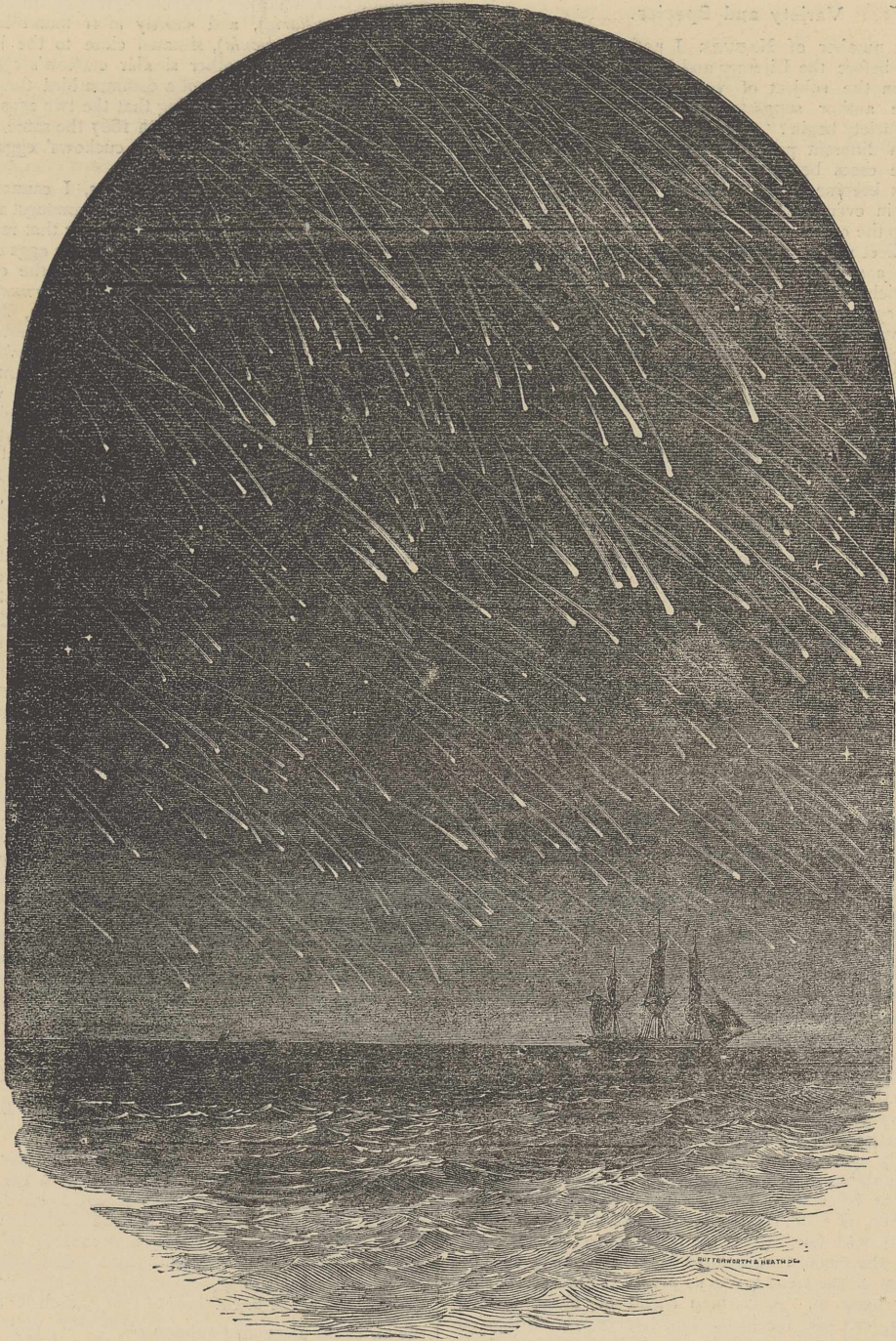
METEORIC SHOWER AS SEEN OFF CAPE FLORIDA