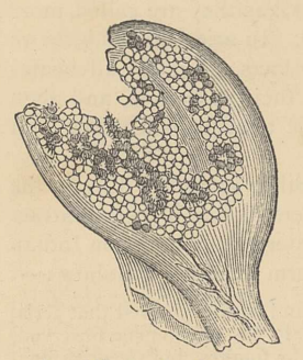
Follen within Ovule of Passiflora

Ray Society. 1869.) I N the volume before us we have the most complete account that has yet been given to the public of the various aberrant forms which are from time to time presented by the different organs of which plants are composed. Such investigations are no mere idle amusement for the leisure hours of naturalists, but have an important scientific bearing. Since botanists have attempted to arrange the vegetable kingdom in a classification possessing a higher claim to the title of "natural"