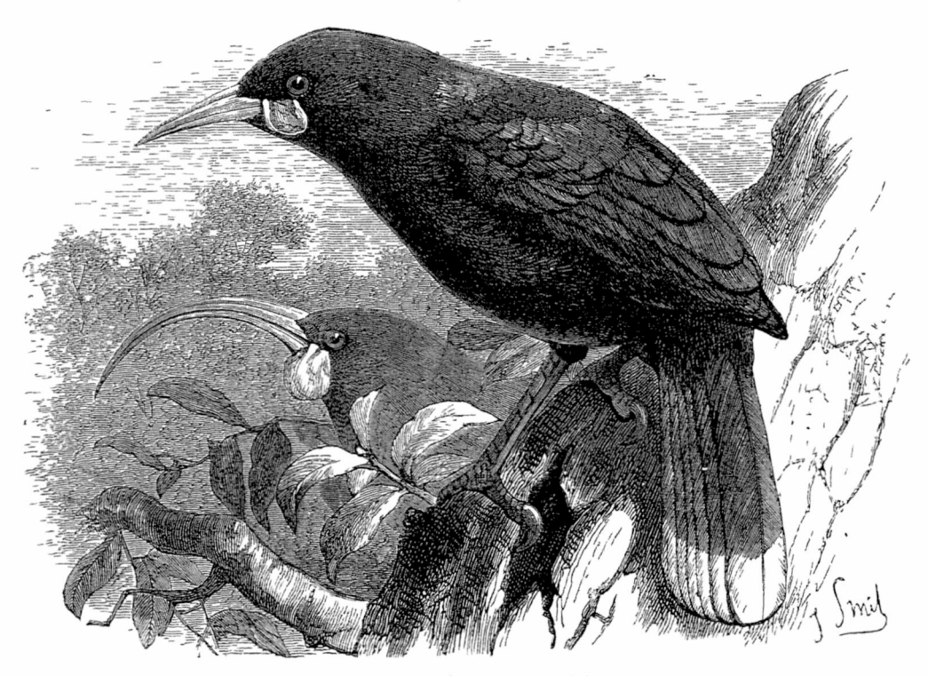
THE HUIA BIRD (Heteralocha gouldi)

2. A Sooty Crow-Shrike (Strepera fuliginosa), purchased on the same day, is one of a peculiar group of Australian birds, of which the Society previously possessed examples belonging to two other species. These are all placed in the cages outside the "Parrot-house," which are devoted to the reception of the hardy species of crows (Corvidæ) and their allies, and at the present moment contain examples of several other species of great interest, such as the yellow-billed chough of the Alps (Pyrrhocorax