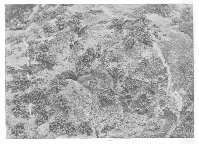
FIG. 1.—The Arctic tern—admirably protected by the surroundings on which it has settled. From "The Home life of the Terns or Sea Swallows," by W. Bickerton.

"The Flowing Road" (3) is full of facts of interest both to the naturalist and the geographer. It is an account of five expeditions, mostly by canoe, along the rivers and streams of the northern countries of South America. Two of these were undertaken with the object of visiting a native people in the south-eastern corner of Venezuela, reported to be savage and unknown. The others, however, as the author tells us, were instigated "neither by a wish to hunt the beasts of the jungle . . . nor to report on the social or industrial conditions of the land, nor even to add to the sum of knowledge of the 'scientific' world -but solely to satisfy the hunger which incites me every now and again to go and ' see things' —the curiosity which Prof. Shale has called the primal instinct." Despite this modest disclaimer, nevertheless Mr. Whitney's narrative, setting forth the true nature of the areas traversed, and of the inhabitants found there, is a really valuable