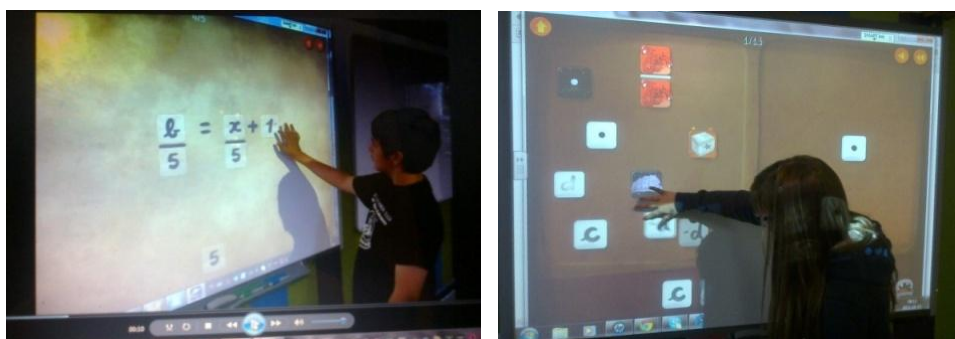
Fig. 2. Playing on the board

such cards below that pair to make a fraction. Then one could use a preceding rule and divide the numbers. The students were not surprised when the pictures started to gather in groups joined with the sign of addition, and in the place of line dividing the board the sign of an equation appeared. Before this change there was not anything meaningful in that the right side is equal to the left one. Students only linked it with the necessity of adding everything to both sides of the board. This rule is stressed all the time – you can do nothing if the move is not repeated.