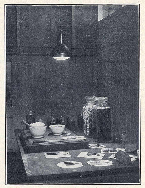
FIG. 2.—Lamplough daylamp (200-watt industrial model) in use at the laboratories of Messrs. Winsor and Newton, Ltd., for grading pigments.

The actual correction attained in all these lamps is good over the brightest part of the visible spectrum between 0.45\mu and 0.65\mu . At the violet end the radiation is very deficient in violet, and at the extreme red end practically all the commercial units give far too much energy (see Fig. 1). The fact that these defects do not destroy the ordinary usefulness of the lamps is owing solely to the low visibility of the radiations corresponding to extreme ends of the spectrum, as shown by the lowest curve in Fig. 1. Occasionally the error is made manifest by some material with a low reflection through most of the spectrum and a