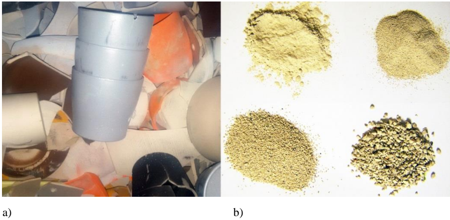
Fig. 1. Post-production ceramic waste (a) crushed ceramics – fractions as in Table 2 (b)