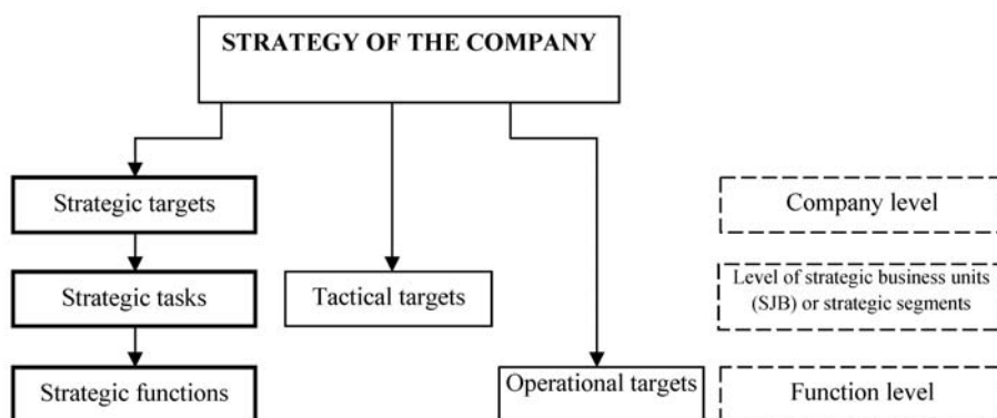
Fig. 2. Company's strategy and hierarchy of targets ( own work )

In terms of types we can distinguish four directions of targets (Butra et al., 2010).