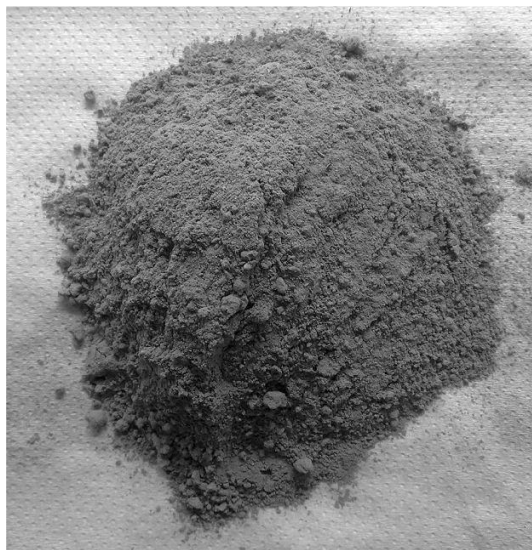
Fig. 1. The ash used to research

Density of ash as determined by helium pycnometry was 2.65 g/cm 3 . The results of the study of the chemical composition is shown in Table 1. The main components of tested ash SiO 2 , P 2 O 5 , K 2 O and CaO.