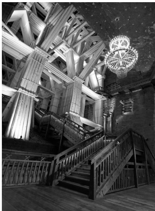
Fig. 1. Grating casing in Michałowice chamber

A periodic monitoring of measurable parameters is a justified method for indication of the status of an interaction between a wooden casing and a rock formation in the course of its use, particularly in the context of: