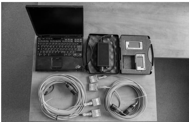
Fig. 2. Subassemblies of the measurement system: recorders with wires (permanent and inspection type) power module and laptop