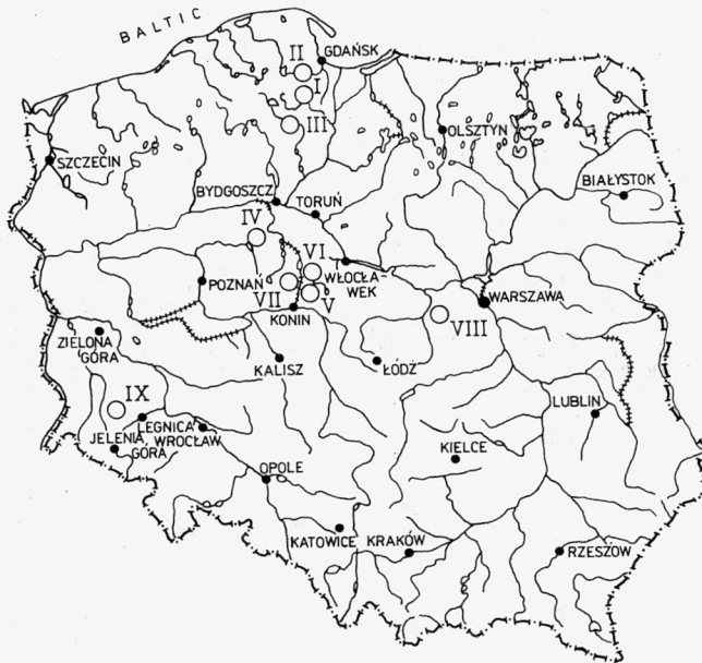
Fig. 1. General localization of the examined catchment areas

All the analyses were performed according to standard methods. Hydrological data were prepared by specialized units of the specific departments of the Institute. The data concerning the consumption of mineral fertilizers in communes, groups of villages or in cooperatives were obtained from the specialized regional institutions. The consumption of fertilizers within the watersheds was calculated proportionally to their areas, applying the factors determined by planimetry of maps. The amounts of nutrients contained in natural fertilizers discharged to the watershed were calculated by an indirect method, based on the data concerning the live stock population in the area investigated and on the commonly used conversion factors. Run-offs of nutrients transported by rivers from the watershed were determined from the relation between the magnitude of the carried instant loads and the accompanying flow magnitudes.