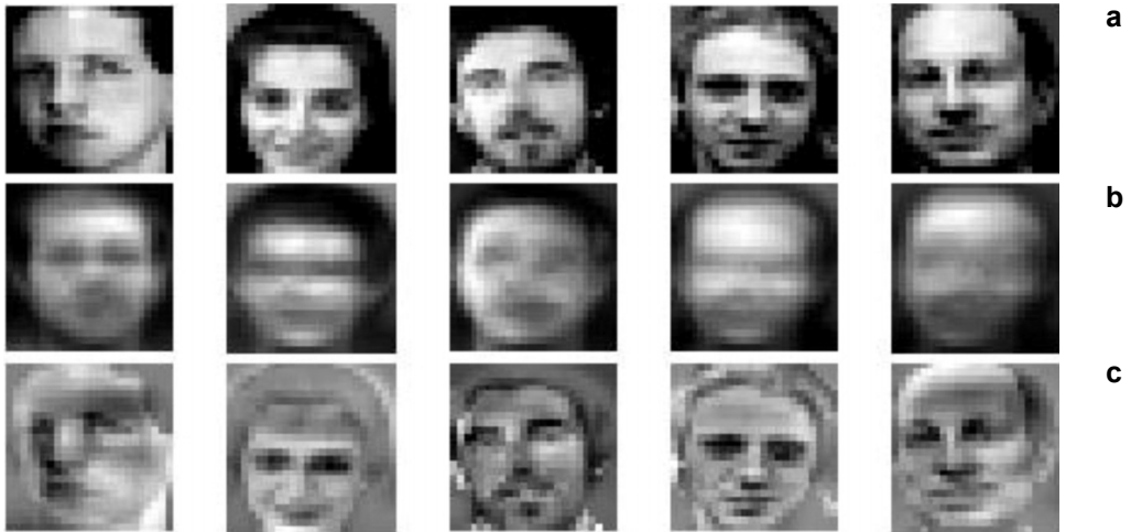
Fig. 1. Original images (a), reconstructed images (b), and residual images (c).

ponents are uncorrelated and whose variances equal unity, as E\{\bar{X} \bar{X}^T\} . The utility of whitening resides in the fact that new mixing matrix for \bar{X} is orthogonal. In the rest of this paper, we assume that all image data have been preprocessed by centering and whitening.