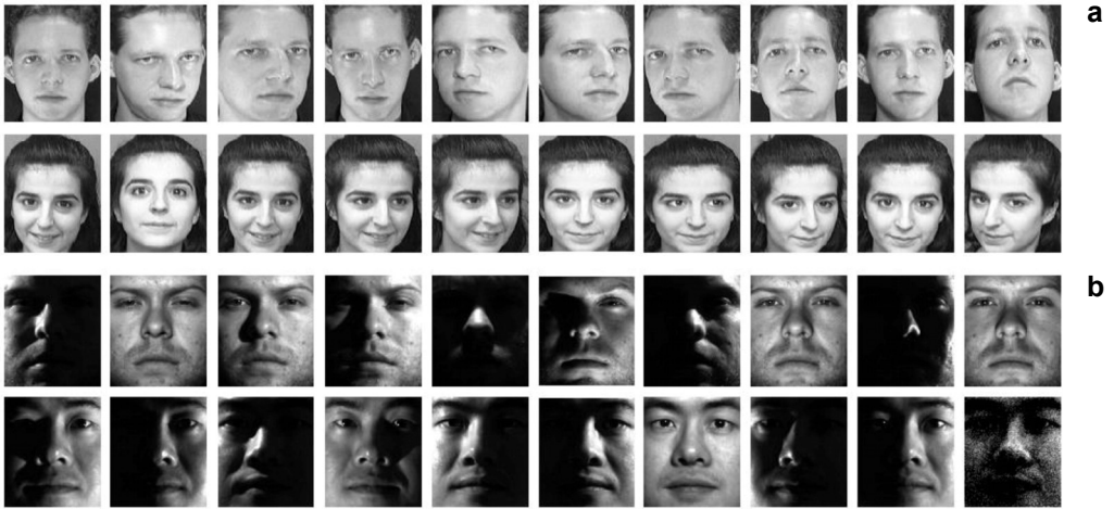
Fig. 3. Some sample images from two databases. ORL database (a), the extended Yale B database (b).

Step 8. Reconstruct image Y_{\text{test}} from the test set V_{\text{test}} and then get the residual images;