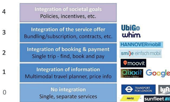
Fig. 1. Topology of Mobility-as-a-Service including levels and examples

Kamargianni et al. [2016] classified MaaS systems regarding different integration levels: 1) partial integration (partially integrated ticket, payment, and ICT); (2) advanced integration (completely integrated ticket, payment, and ICT); and (3) advanced integration with mobility packages. Sochor et al. (2018) developed a typo-logy of MaaS schemes distinguishing four integration levels and a basic level without integration (Figure 1).