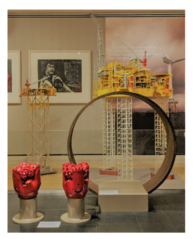
Fig. 1. Oil objects in Scotland: A Changing Nation

The developments in the industry since the 1960s were already well represented in the NMS collections by drill and platform models used to inform manufacture, samples of North Sea oil, and a cross section of the Ninian oil pipeline from Sullom Voe terminal in Shetland, which is on display alongside drill bits and a model of the Elgin wellhead in the Scotland: A Changing Nation gallery in the Museum of Scotland (Fig. 1).