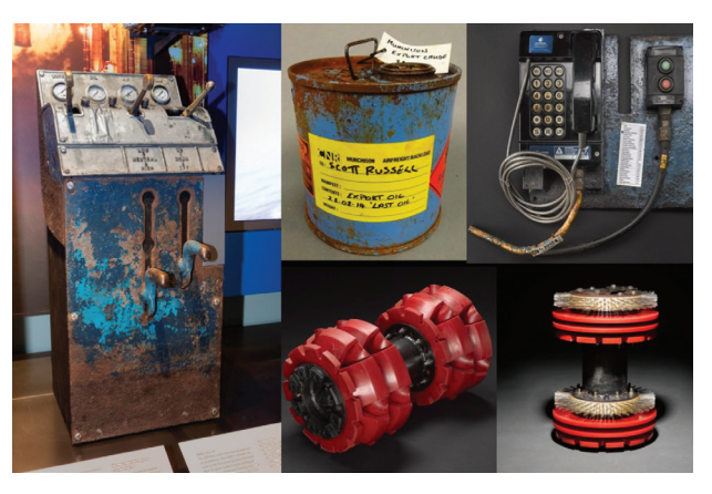
Fig. 4. Objects collected from the Murchison Oil Platform including the driller's console, last oil, driller's telephone and pipeline pigs

II. 3. Artystka Sue Jane Taylor z grafiką z wystawy w 2017 r., Age of Oil