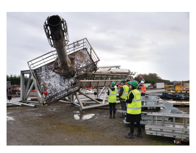
Fig. 7. National Museums Scotland staff inspect the flare tip in a storage yard on the mainland

into the building and display it safely are being addressed, along with the question of how to work a project of this size into museum schedules that are already very tight. However, in the near future we intend to properly share this object with our audiences, as the oil and gas industry and its decommissioning continues to play a central role in Scottish life, albeit a shifting role in an ever-changing social, political and economic environment.