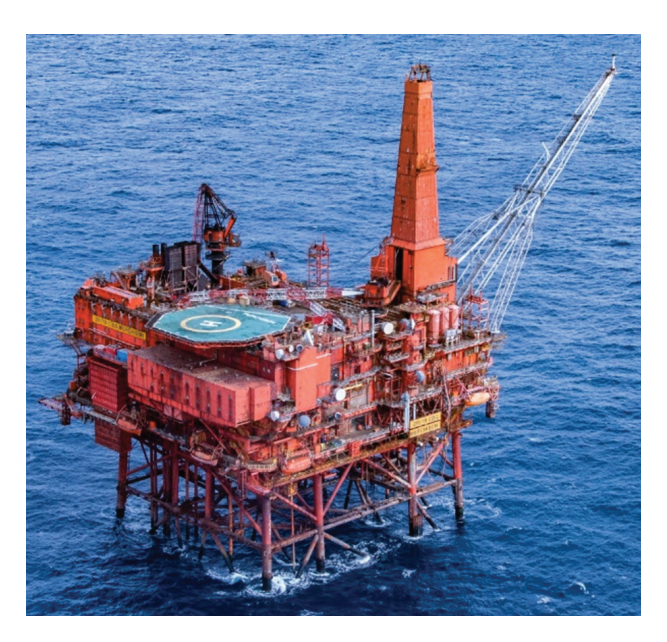
Fig. 5. Murchison Oil Platform dwarfs the flare tip (top right)

Il. 5. Platforma wiertnicza Murchison przygasza pochodnię (u góry po prawej)