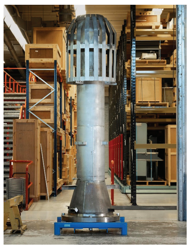
Fig. 8. The flare tip in storage at the National Museums Collection Centre

Il. 7. Personel National Museums Scotland sprawdza końcówkę pochodni na placu składowym na kontynencie